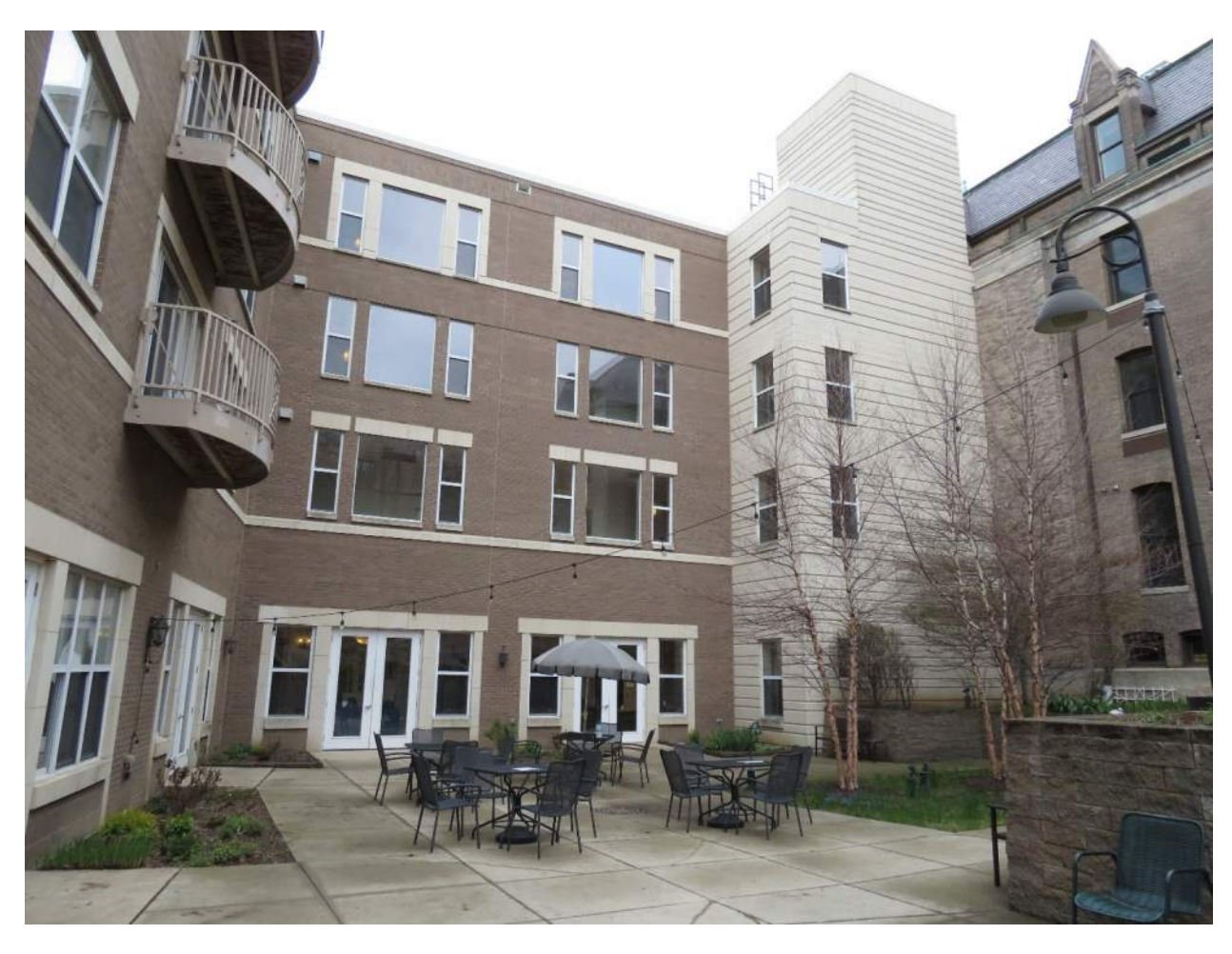
Contemporary Commons Courtyard – location of ramp addition