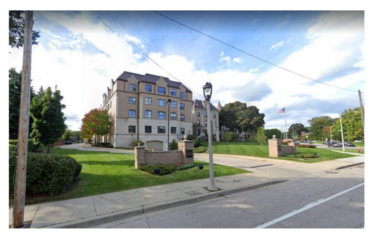
Watertower – Southeast View from Lake Dr public way