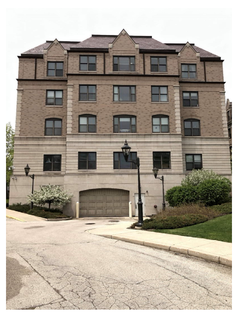
Watertower East elevation – Lake Dr