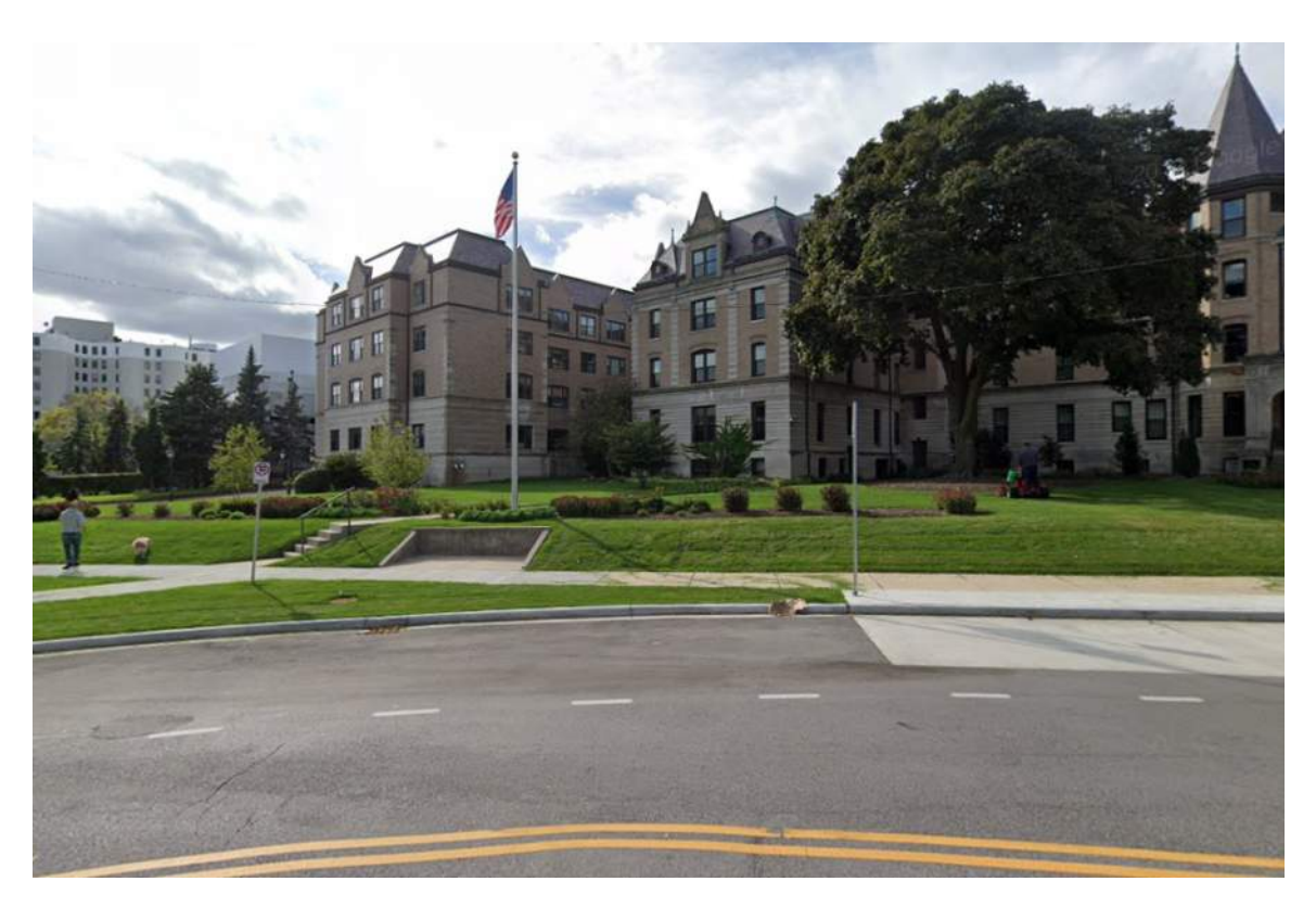
Watertower – Northeast View from Downer Ave Public Way