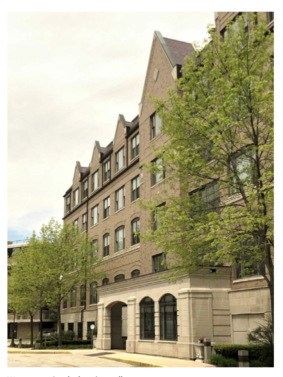
Watertower South elevation – alleyway