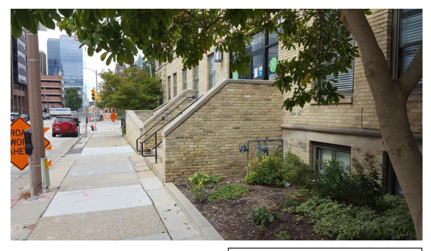
Exhibit C View of east facade of ramp and stair. Existing gas meter to remain.