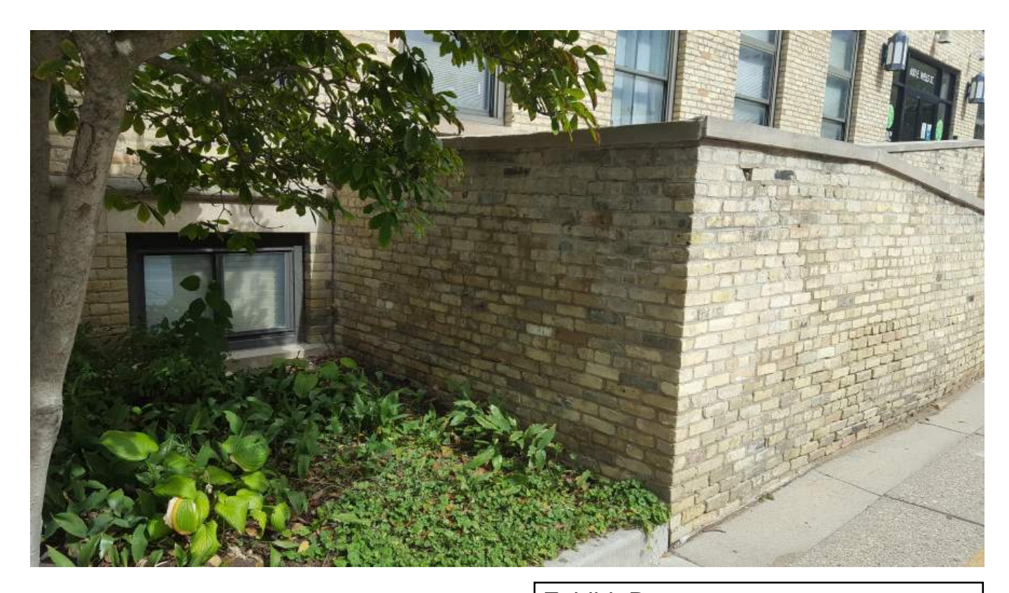
Exhibit D View of west facade of ramp. Tree to the west obscures most of this view from N. Jackson St.

Exhibit C View of east facade of ramp and stair. Existing gas meter to remain.