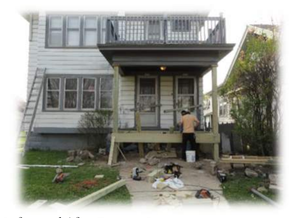
Before and After Exterior Repair

Forty one homeowners received grants so far. The total amount of grants given out was over $115,000 that leveraged an additional $120,000 of homeowner funds. An additional $20,000 is committed to residents who are still currently making repairs and improvements. This puts the total up to $255,000 in total home improvements over the course of the year.