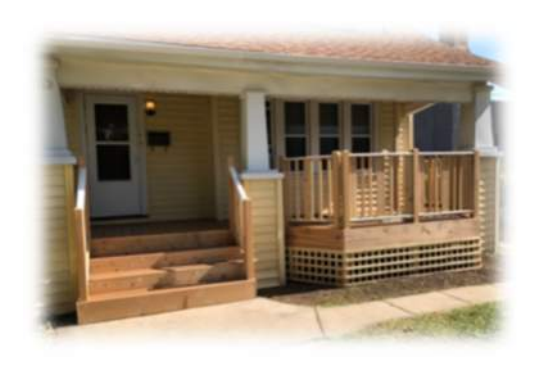
Before and After Porch Repair