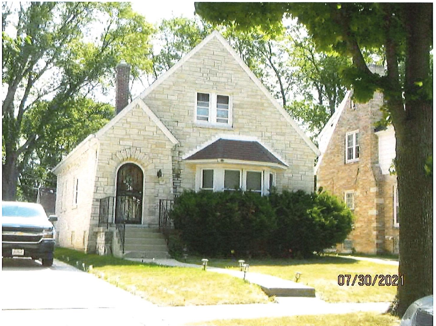
4554 North 24 th Street