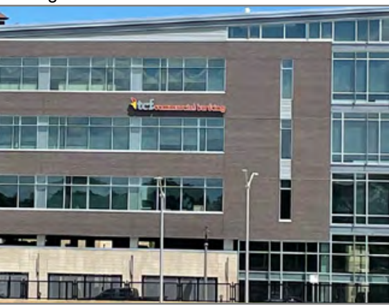
Existing Dimensions: 2' 6-1/2"h x 20' 1"