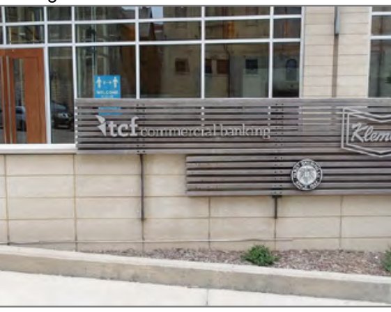
Existing Dimensions: 7-1/2"h x 5' 0-1/2"