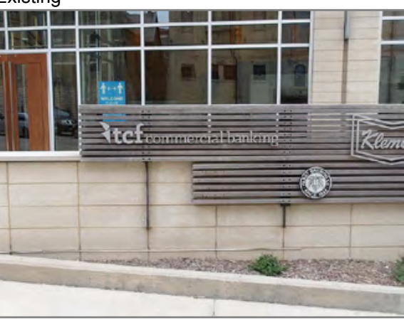
Existing Dimensions: 7-1/2"h x 5' 0-1/2"