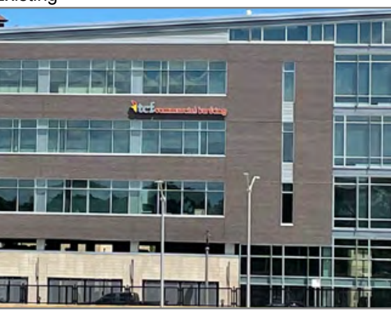
Existing Dimensions: 2' 6-1/2"h x 20' 1"