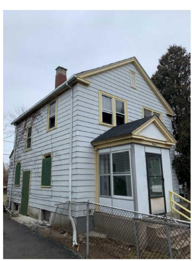
Date Taken: 3/10/2021