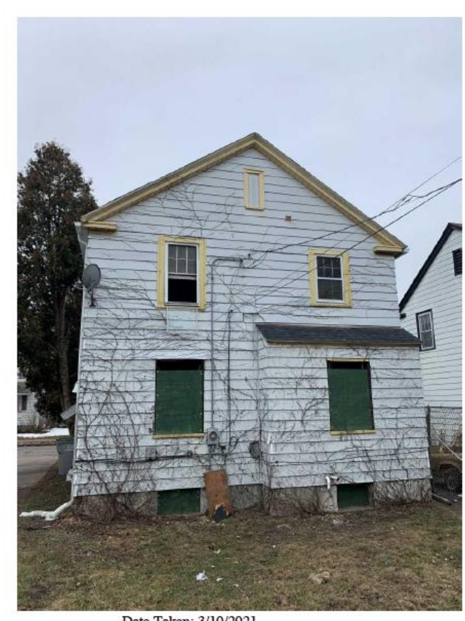
Date Taken: 3/10/2021