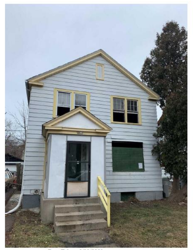
Date Taken: 3/10/2021