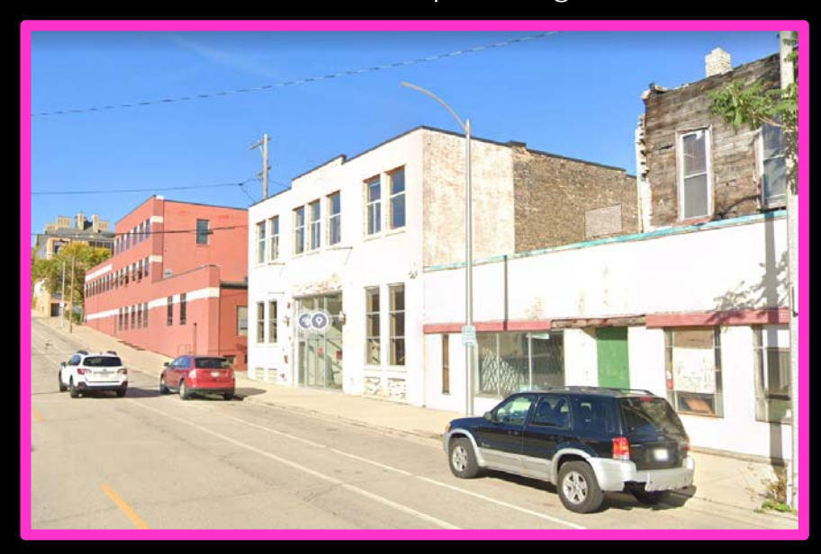
View from N. Vel R. Phillips looking north-east