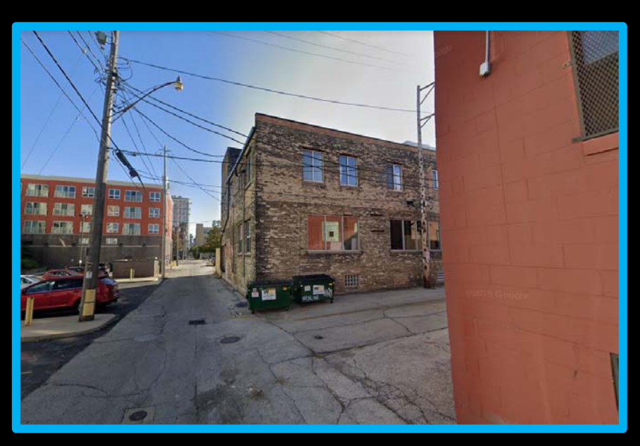
View from alley looking south-west