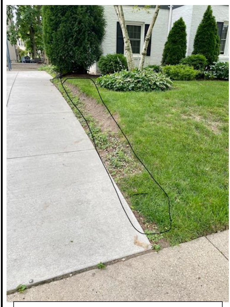
West side of driveway