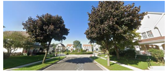
Property to be Transferred