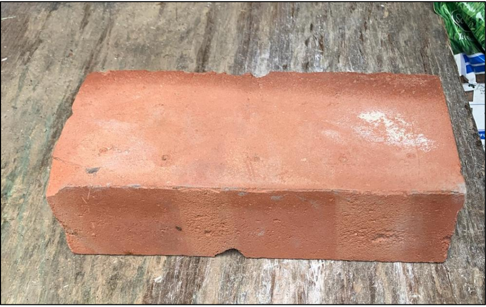
Reclaimed brick 3 ¾" x 2 ½" x 8 ½ "