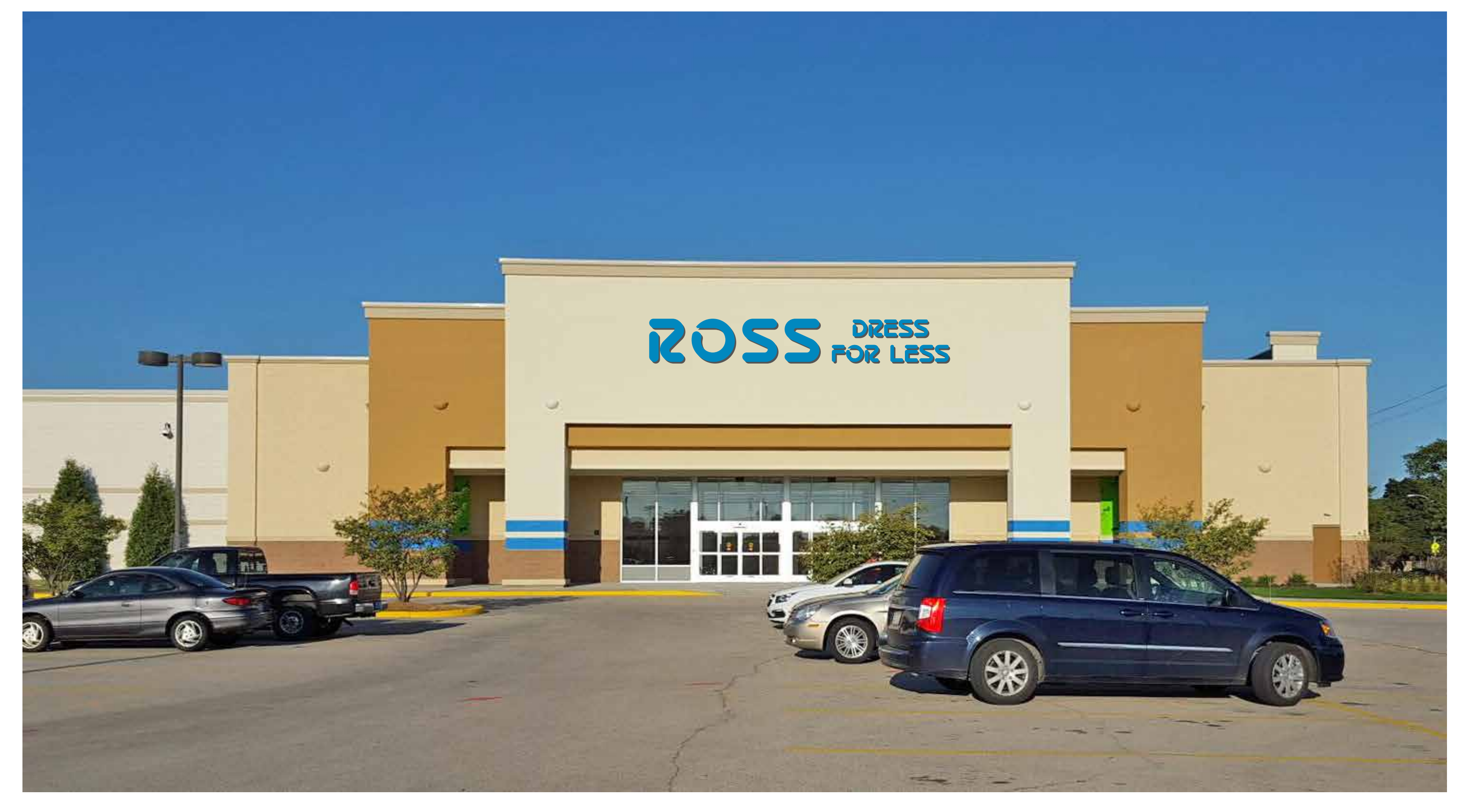
60" ROSS - 24" DRESS / FOR LESS