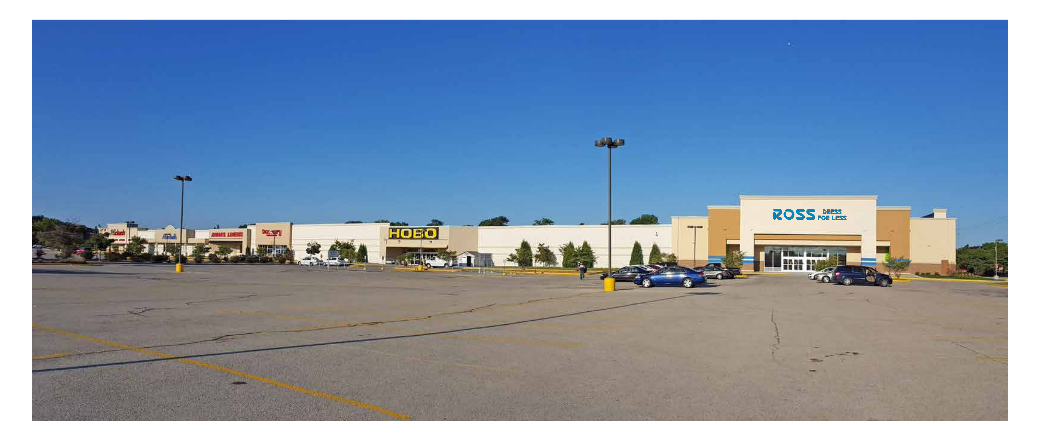
60" ROSS - 24" DRESS / FOR LESS