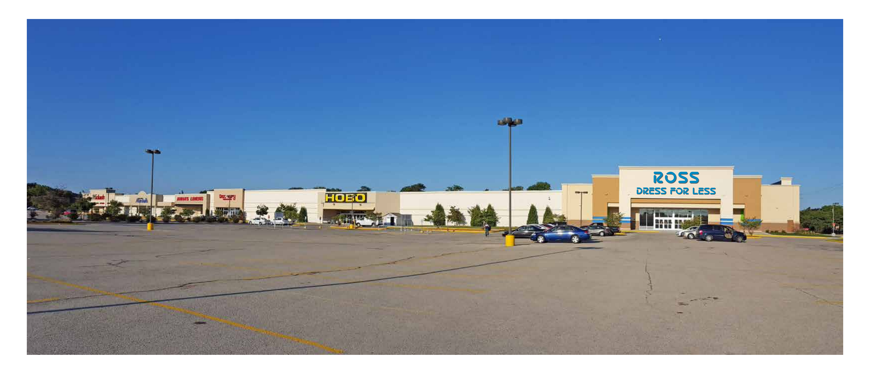
72" ROSS/ 42" DRESS FOR LESS