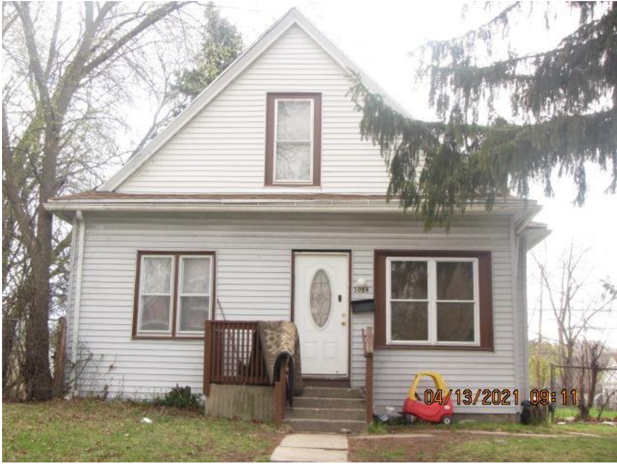
5024 North 32 nd Street