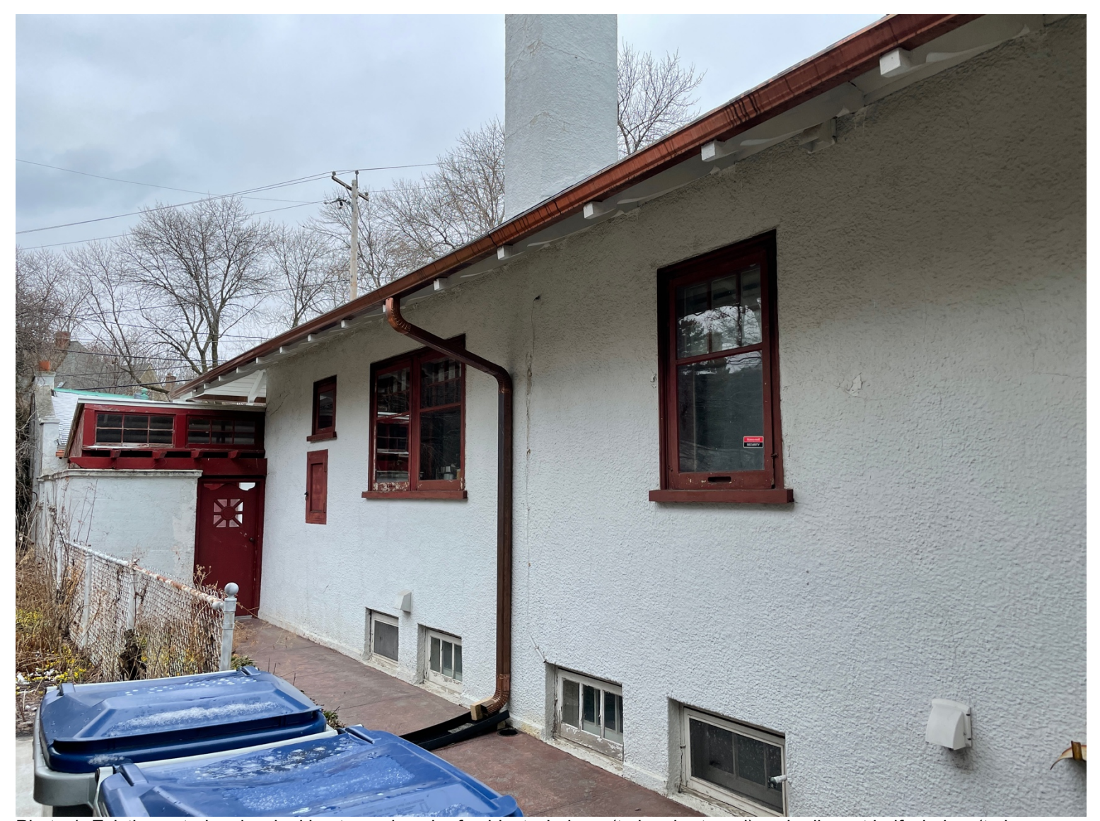
Photo 1: Existing exterior view looking towards pair of subject windows (to be shortened) and adjacent half window (to be removed and replaced with window that matches existing pair)