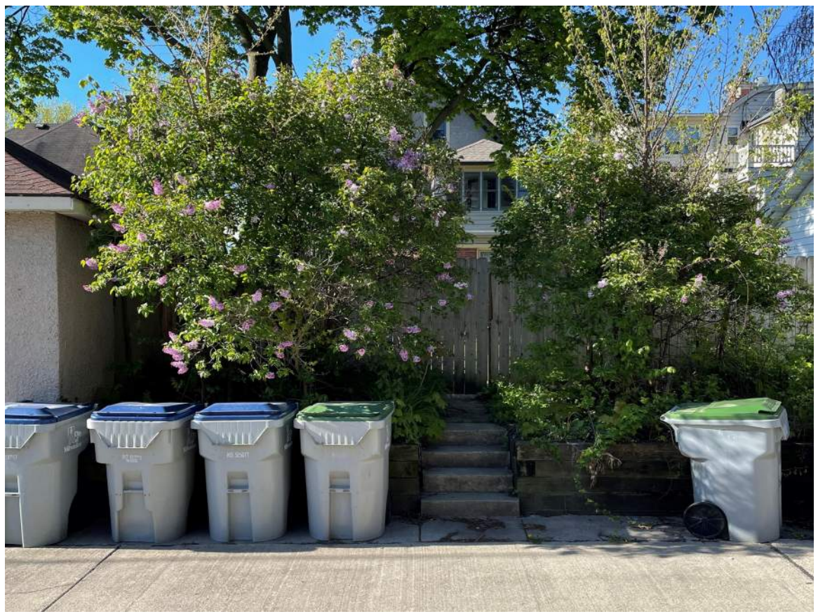
Photo 6 - North Elevation of the Lot Showing the Existing Retaining Wall and Fence West of the Garage