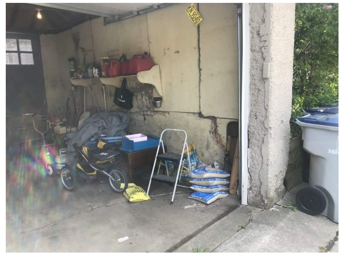
Photo 9 - West Elevation of the Interior of the Existing Garage Showing Deterioration of the Structure