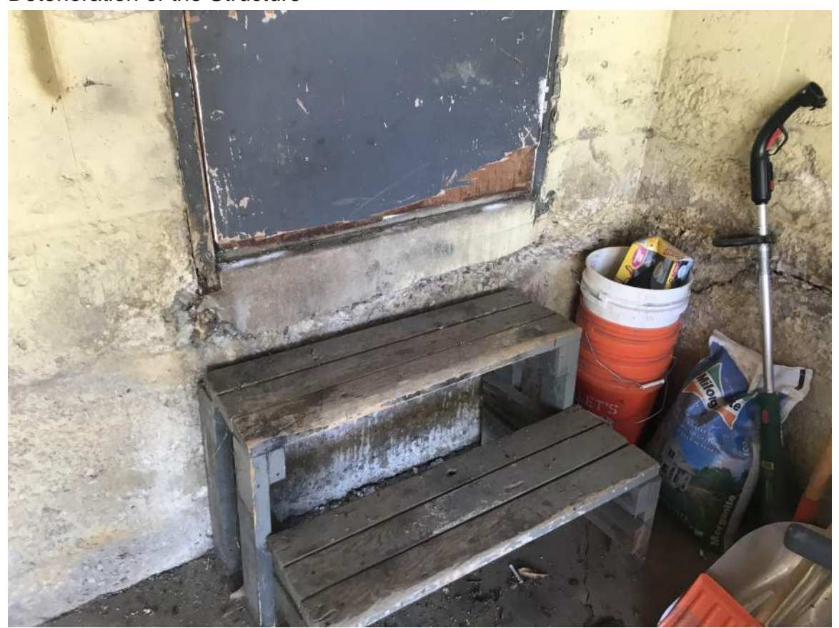
Photo 11 - Southwest Corner of the Interior of the Existing Garage Showing Deterioration of the Structure by the Service Door