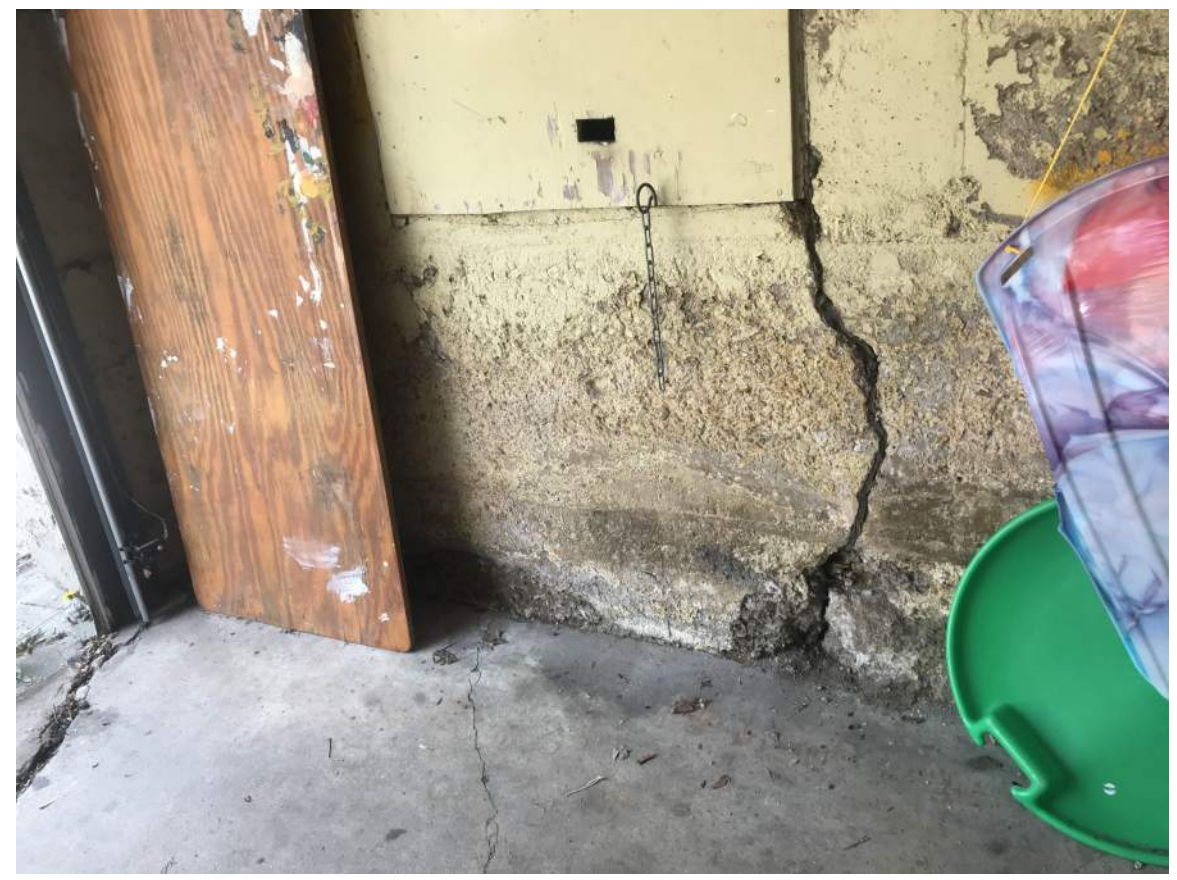
Photo 8 - East Elevation of the Interior of the Existing Garage Showing Deterioration of the Structure