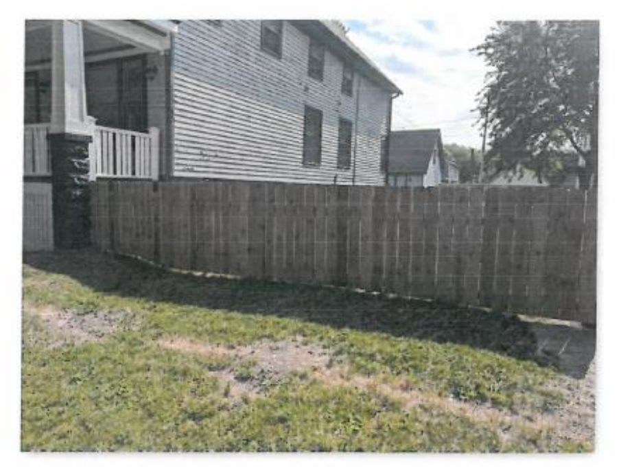
Street view of fence on south side of house