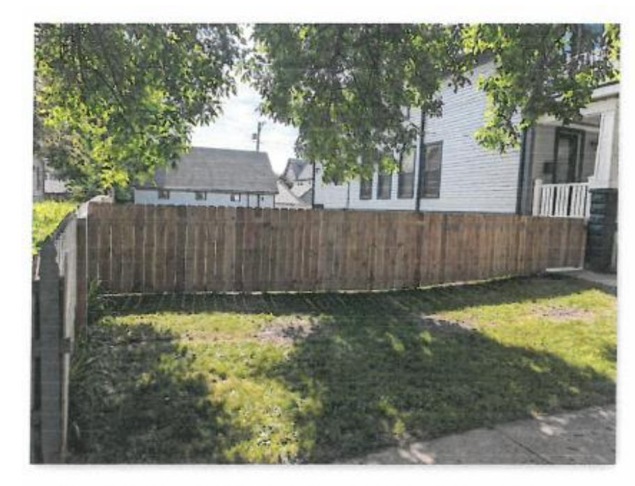
Street view of fence on north side of house