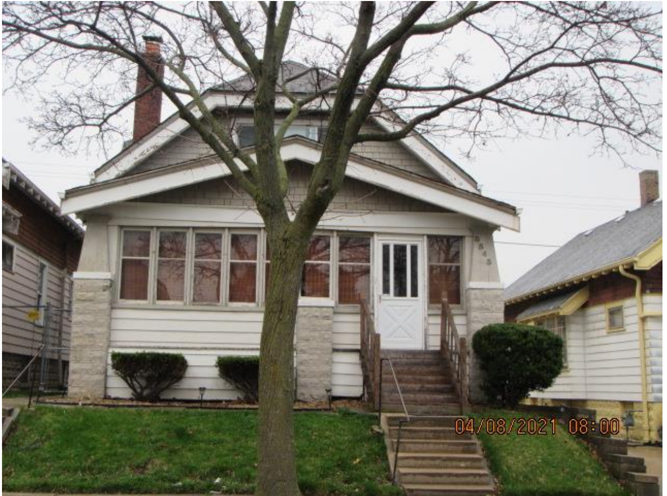
3543 North 21st Street