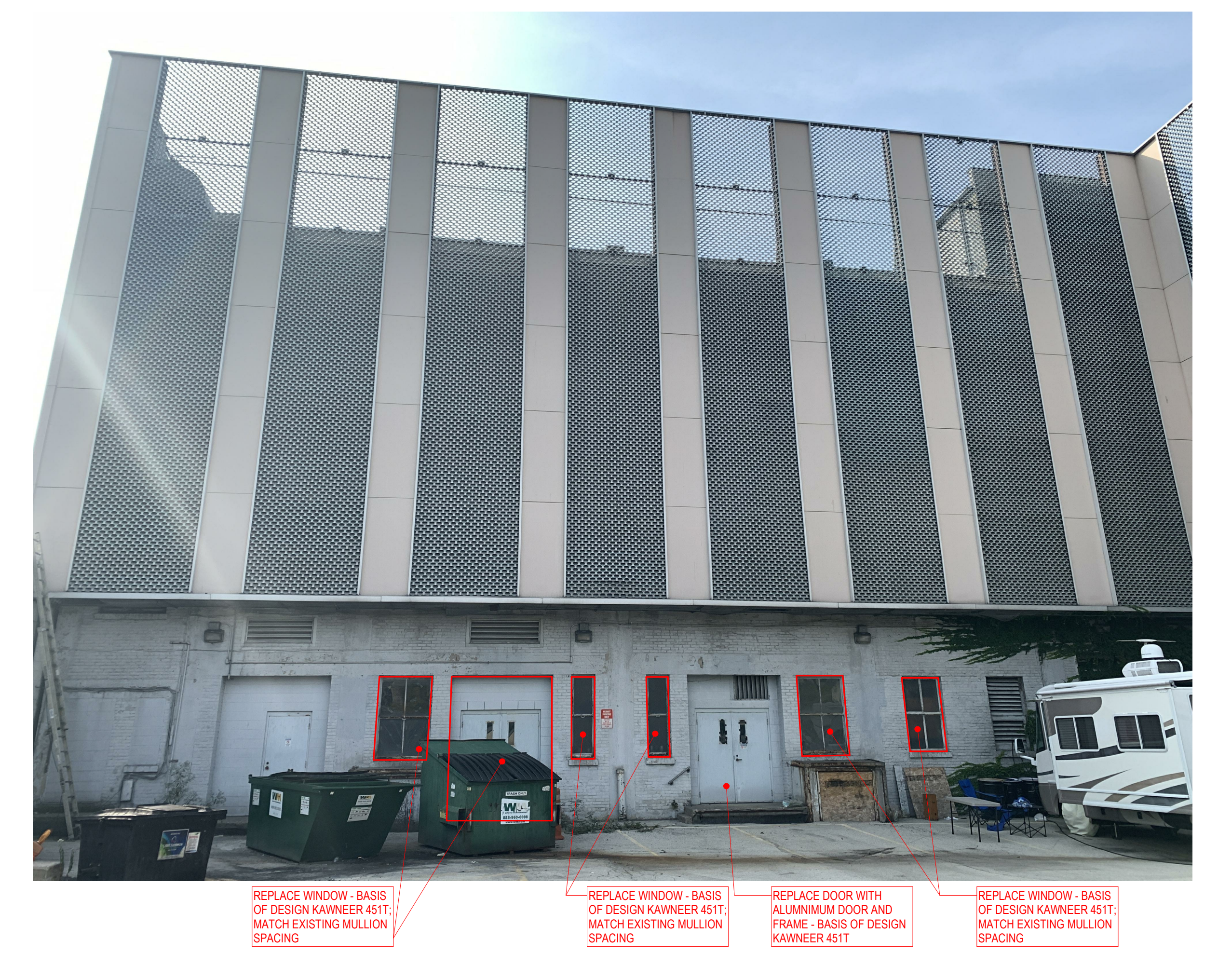
2020 - CURRENT CONDITION EAST ELEVATION