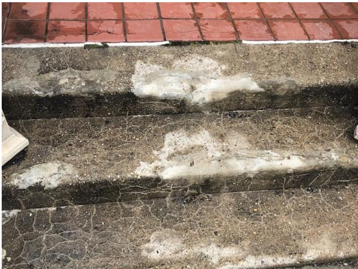
Back porch steps & patio