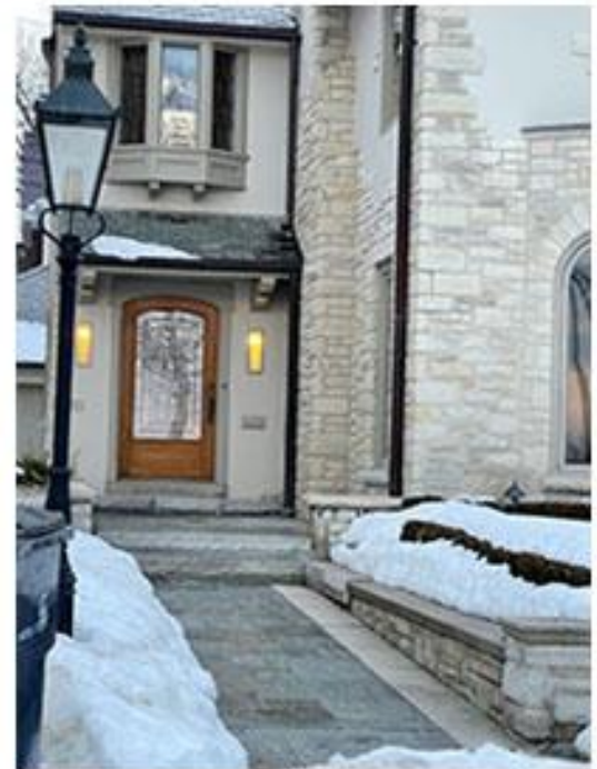
Houses close to us with bluestone from the same approximate era