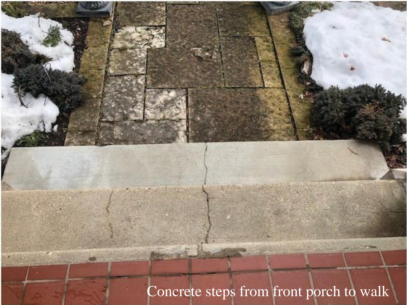
Concrete steps from front porch to walk