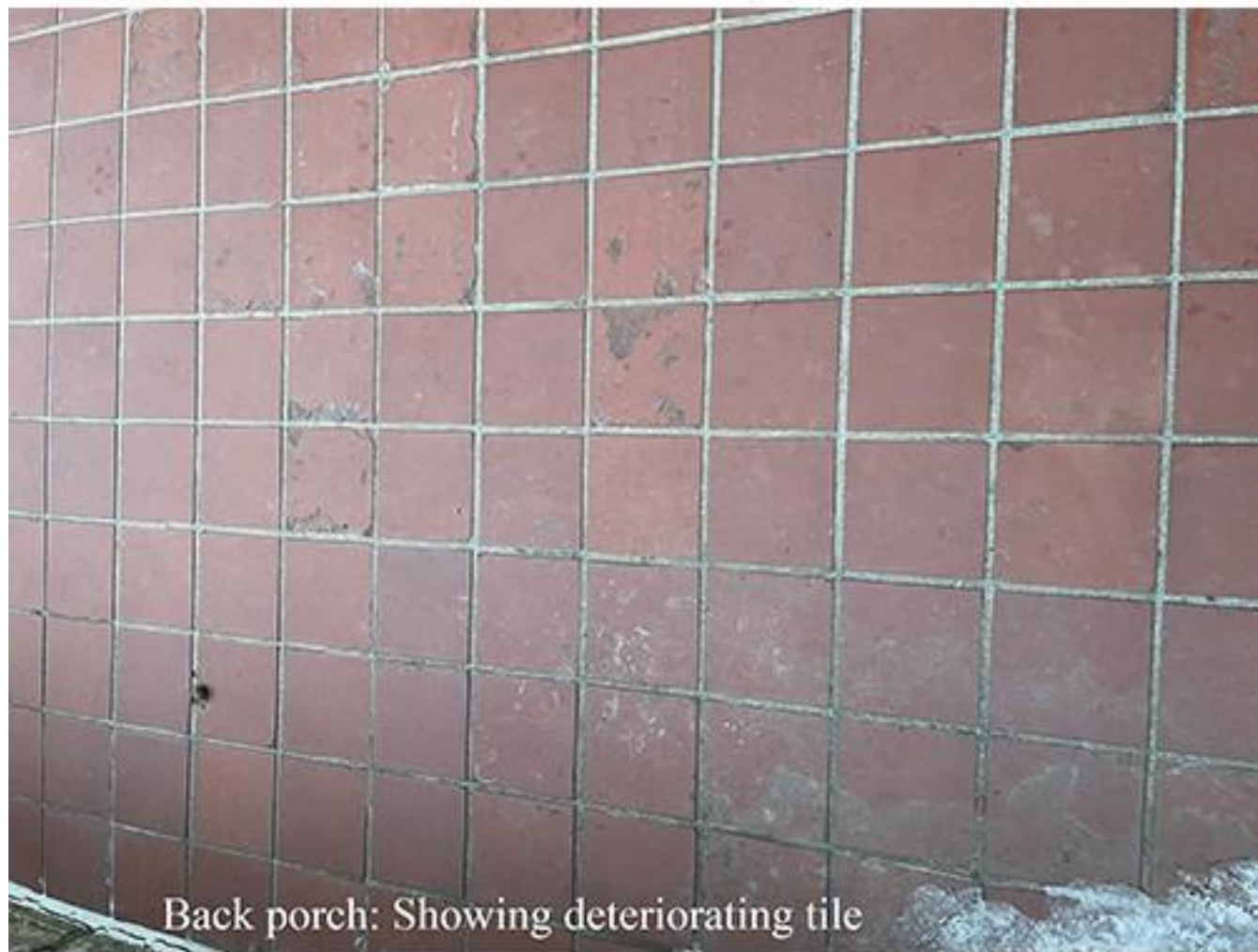
Back porch: Showing deteriorating tile