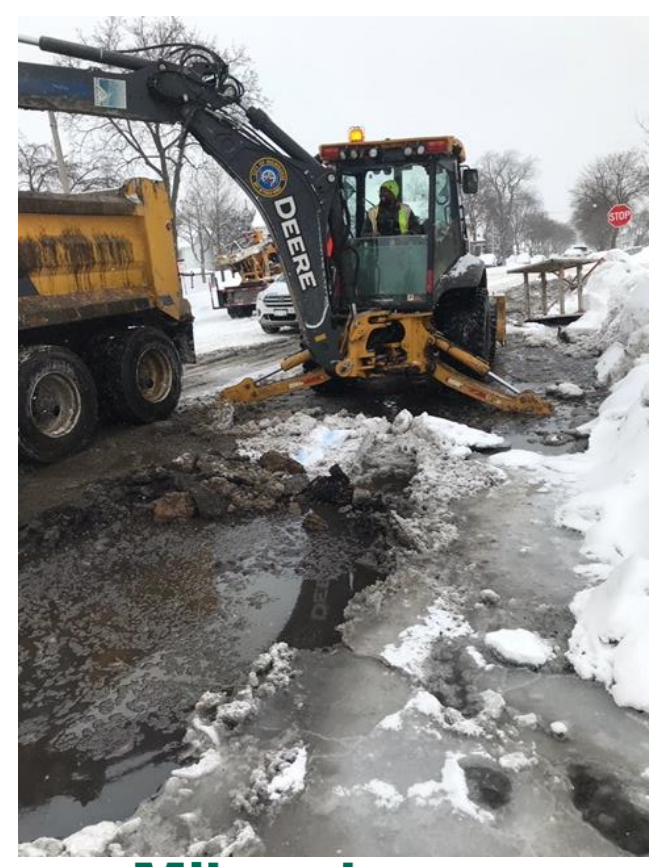
Milwaukee Water Works