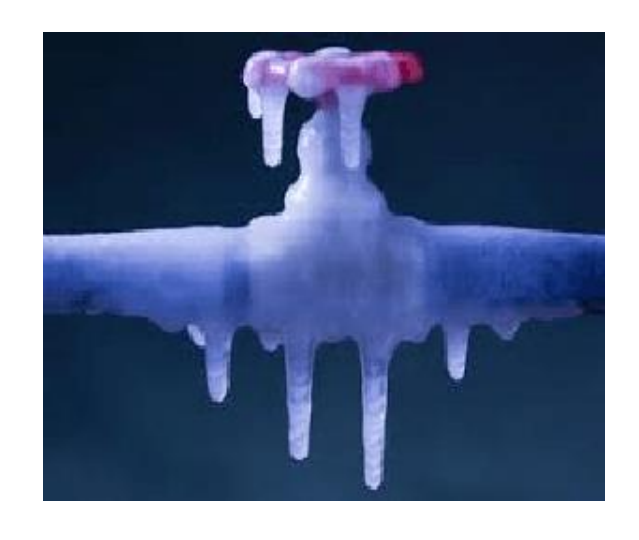
Winter in Milwaukee

https://city.milwaukee.gov/water/News/Winter-in-Milwaukee