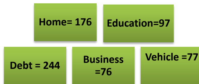
212 Active IDA Clients as of 12/31/2020