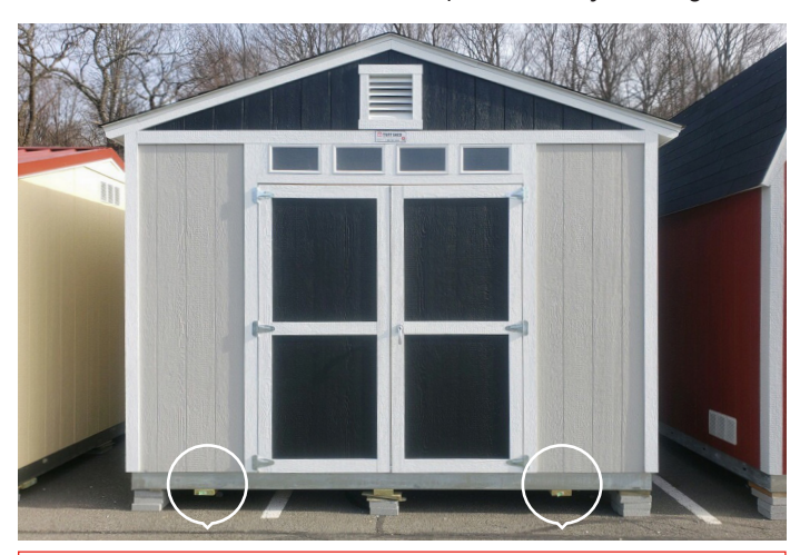
Figure 3 - Display building with wood skids beneath the floor joists

Buildings used as displays will be leveled by placing concrete blocks and wooden shims under the perimeter floor joists only. Display buildings may also include wood skids under the floor joists, which will not be removed or leveled upon delivery. See figure 3.