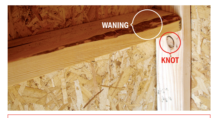
Waning and Knotted Lumber

We use dimensional lumber for wall and roof framing that has been dried, then stored in a controlled environment (our factories) prior to installation. It is unlikely that this wood will have a uniform appearance, and may have blemishes or "waning and knots". This is normal and will not affect the structural integrity of the building.