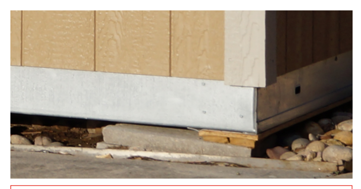
Figure 2 - Close-up of leveling with blocks & shims

Blocking up or "shimming" a building is not always the best solution from an appearance standpoint. Please consider the appearance and your long term satisfaction in the building when making the leveling decision. See figure 2.