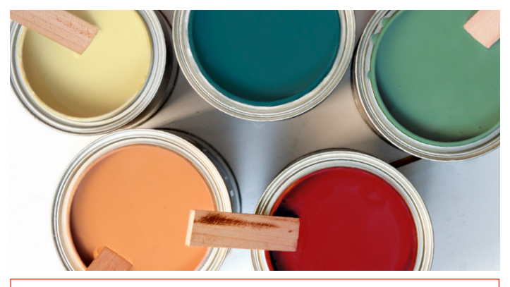
Routine painting is essential to a shed's overall protection