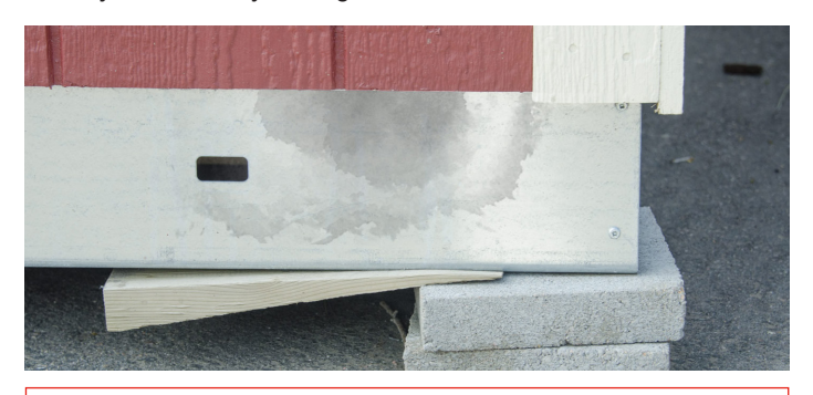
White "chalking" on the steel