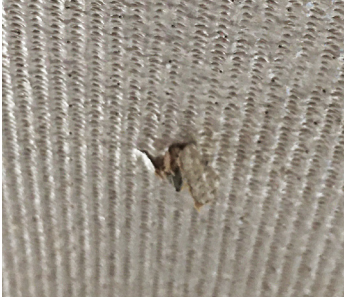
Roofing nails piercing roof decking