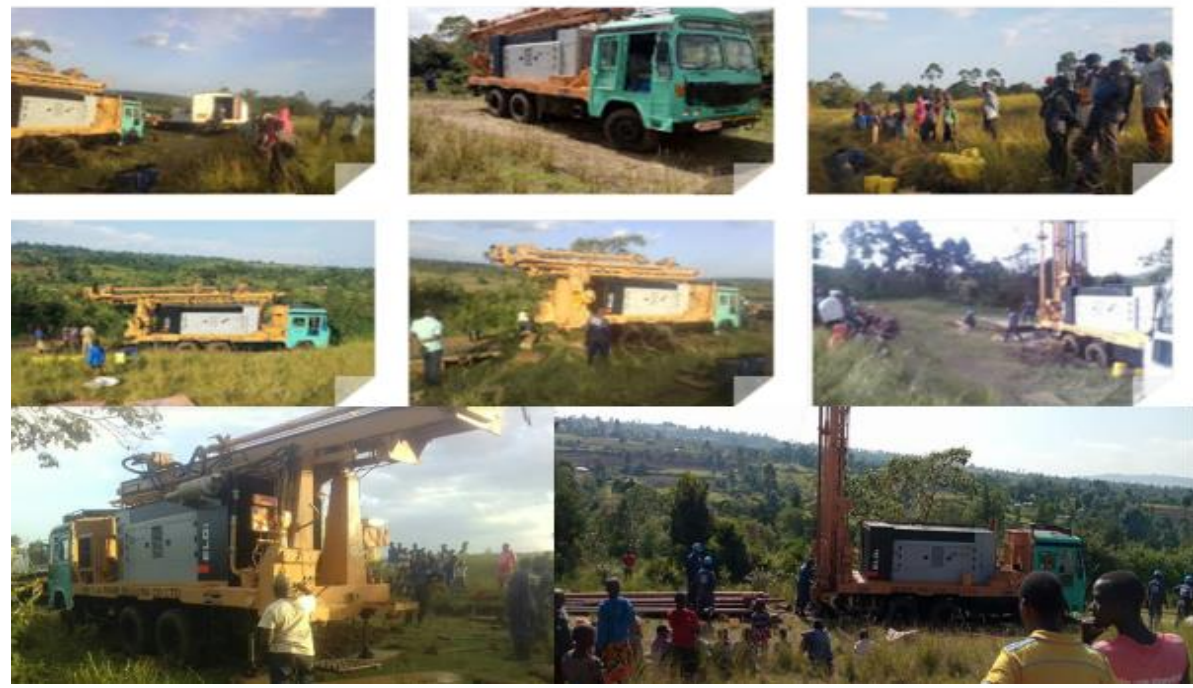
Water project in the village of Sigowet in Bomet will server approximately 8,000 people once completed. The Challenge has been the high levels of chloride and funds are needed to complete the water filtration process.