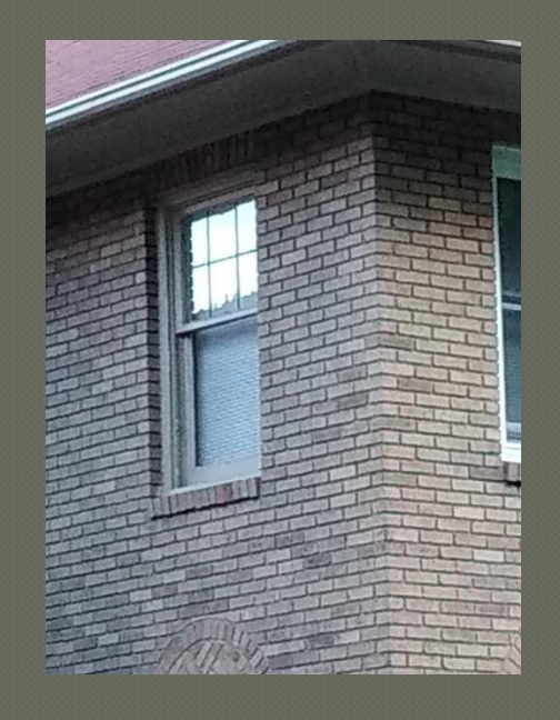
Original Window detail

After original windows removed and replacements inserted.