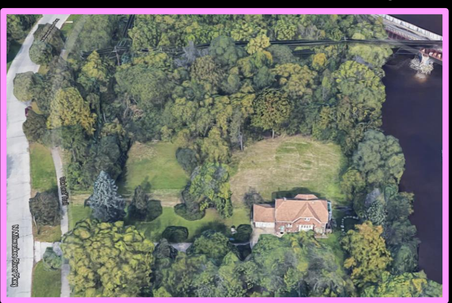
Milwaukee River Milwaukee River