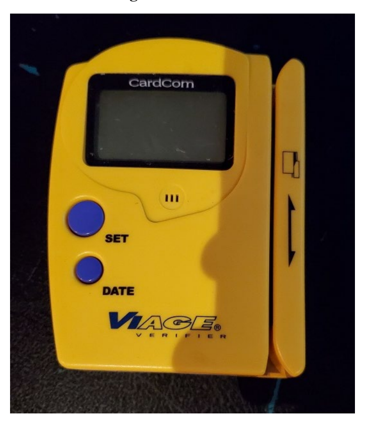
Certification of Performance