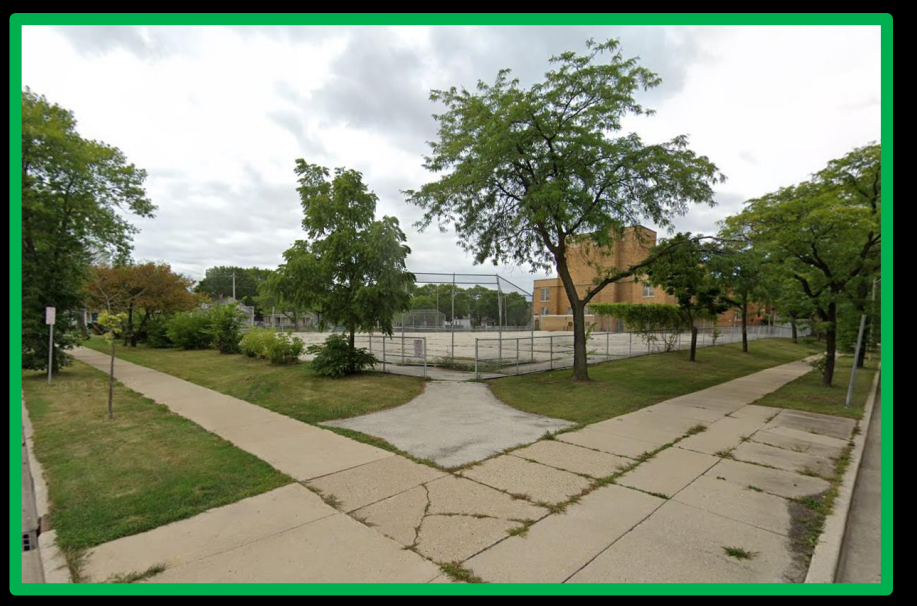
View from W Rohr Ave and N 36th St looking north-west