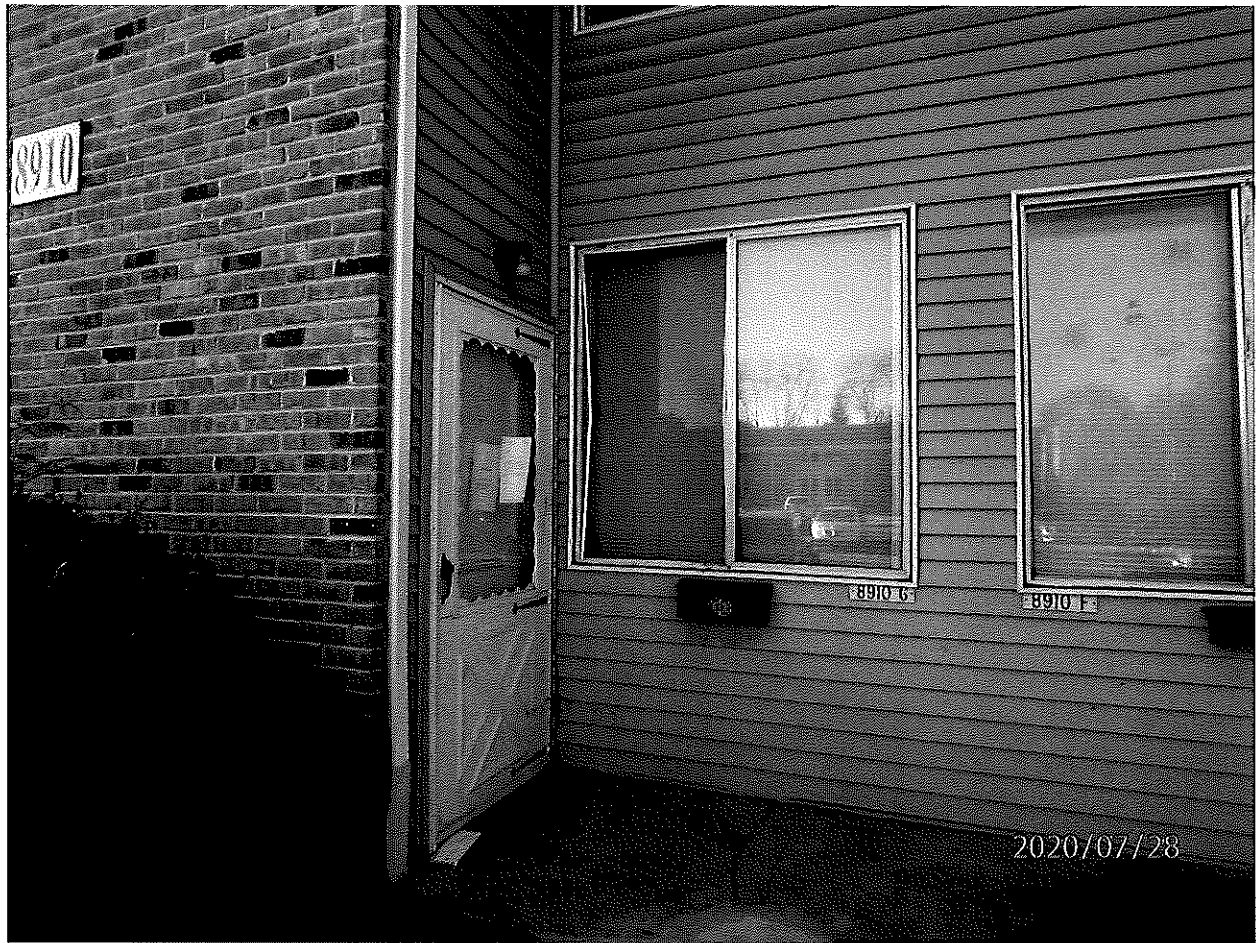
8910 North 95 – unit G