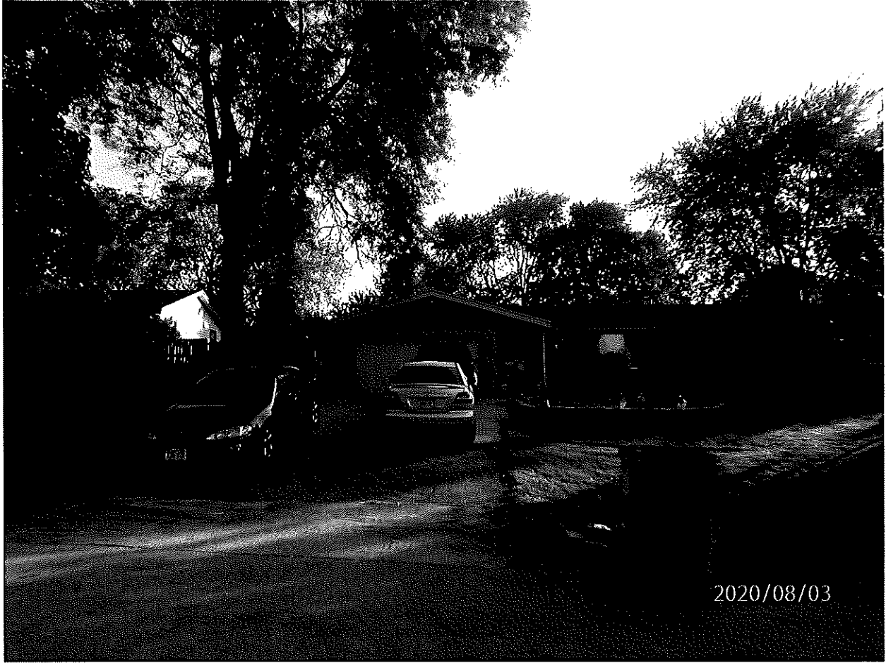
9534 W Marcelle Ave