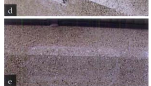
Figure 18. (a) Exposed aggregate precast concrete is sounded with a hammer to detect areas of deterioration. Corrosion of the exposed reinforcing steel bar has led to spalling of the adjacent concrete. (b) Samples of aggregate considered for use in repair concrete are compared to the original concrete materials in terms of size, color, texture, and reflectance. (c) Various sample panels are made using the selected concrete repair mix design for comparison to the original concrete on the building, and the mix design is adjusted based on review of the samples. (d) After removal of the spall, the concrete surface is prepared for installation of a formed patch, (e) Prior to placement of the concrete, a retarding agent is brush-applied to the inside face of the formwork to slow curing at the surface. After the concrete is partially cured, the forms are removed and the surface of the concrete is rubbed to remove some of the paste and expose the aggregate to match the original