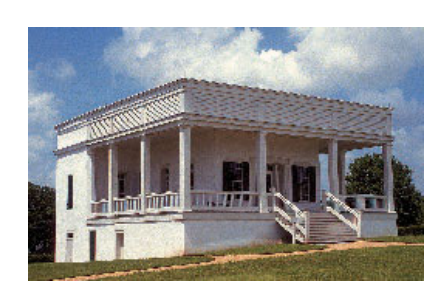
Figure 1. The Sebastopol House in Seguin, Texas, is an 1856 Greek Revival-style house constructed of lime concrete. Lime concrete or "limecrete" was a popular construction material, as it could be made inexpensively from local materials. By 1900, the town had approximately ninety limecrete structures, twenty of which remain.

The early history of concrete was fragmented, with developments in materials and construction techniques occurring on different continents and in various countries. In the United States, concrete was slow in achieving widespread acceptance in building construction and did not begin to gain popularity until the late nineteenth century. It was more readily accepted for use in transportation and infrastructure systems.