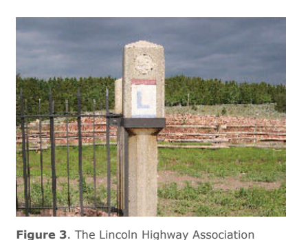
promoted construction of a high quality continuous hard surface roadway across the country. The Boys Scouts of America installed concrete road markers along the Lincoln Highway in 1928.

Impressed by the economic advantages of poured gravel wall or "lime-grout" construction, the Quartermaster General's Office of the War Department embarked on a campaign to improve the quality of building for frontier military posts. As a result, lime-grout structures were constructed at several western posts soon after the Civil War, including Fort Fred Steele and Fort Laramie, both in Wyoming (Figure 2). By the 1880s, sufficient experience had been gained with unreinforced concrete to permit construction of much larger buildings. A notable example from this period is the Ponce de Leon Hotel in St. Augustine, Florida.