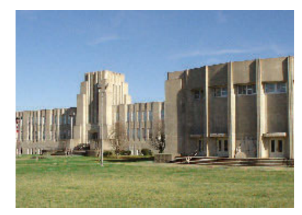
Figure 6. The Bailey Magnet School in Jackson, Mississippi, was designed as the Jackson Junior High School by the firm of N. W. Overstreet & Town in 1936. The streamlined building exemplifies the applicability of concrete to creating a modern architectural aesthetic.

buildings designed and constructed under the auspices of the Public Works Administration. Recreational structures and landscape features also utilized the structural range and unique character of exposed concrete to advantage, as see