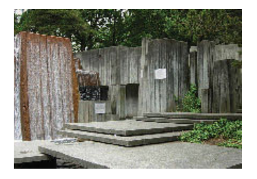
Figure 9. The Ira C. Keller Fountain in Portland, Oregon, was designed by Lawrence Halprin and constructed in 1969. The fountain is constructed primarily of concrete pillars with formboard textures and surrounding elements, patterned with geometric lines, which facilitate the path of water.

During the twentieth century, there was a steady rise in the strength of ordinary concrete as chemical processes became better understood and quality control measures improved. In addition, the need to protect embedded reinforcement against corrosion was acknowledged. Requirements for concrete cover over reinforcing steel, increased cement content, decreased water-cement ratio, and air entrainment all contributed to greater concrete strength and improved durability.