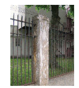
Figure 15. Evidence of moisture movement through concrete is apparent in the form of mineral deposits on the concrete surface. Cyclic freezing and thawing of entrapped moisture, and corrosion of embedded reinforcement, have also contributed to deterioration of the concrete column on this fence at Crocker Field in Fitchburg, Massachusetts, designed by the Olmsted Brothers.

A number of nondestructive testing methods can be used in the field to evaluate concealed conditions. Basic techniques include sounding with a hand-held hammer (or for horizontal surfaces, a chain) to help identify areas of delamination. More sophisticated techniques include impact-echo testing (Figure 16), ground penetrating radar, pulse velocity, and other methods that characterize concrete thickness and locate voids or delaminations. Magnetic detection instruments are used to locate embedded reinforcing steel and can be calibrated to identify the size and depth of reinforcement. Corrosion measurements can be taken using copper-copper sulfate half-cell tests or linear polarization techniques to determine the probability or rate of active corrosion of the reinforcing steel.