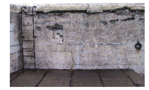
Figure 13. Fort Casey on Admiralty Head, Fort Casey, Washington, was constructed in 1898. The lift lines from placement of concrete are clearly visible on the exterior walls and characterize the finished appearance.

It is common for historic concrete to have a highly variable appearance, including color and finish texture. Different levels of aggregate exposure due to paste erosion are often found in exposed aggregate concrete. This variability in