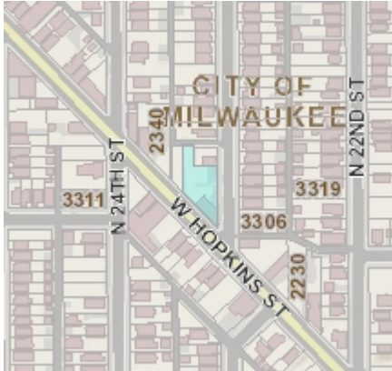
Parcel location within Milwaukee County