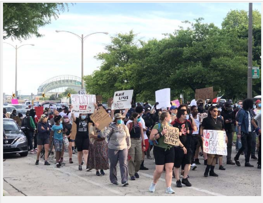
June 6th, 2020 George Floyd protest march.

The City of Milwaukee is still months away from initiating its 2021 budget process, but members of the Common Council are already moving to make their priorities clear.