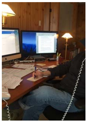
Gov't Insider Issues Warning to Us Citizens (He Predicted Trumps Election)