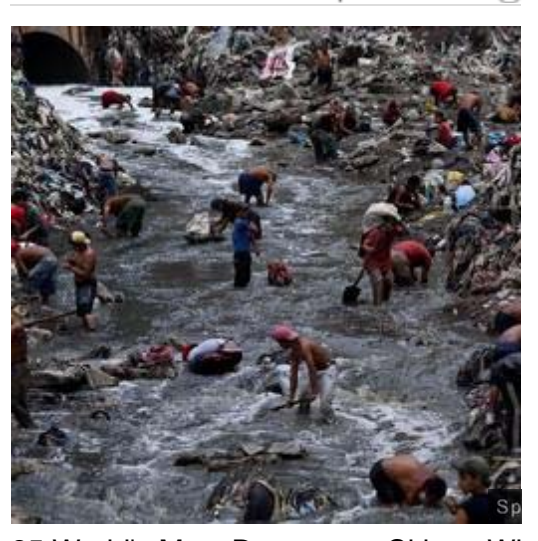
25 World's Most Dangerous Cities - WI Not to be a Tourist