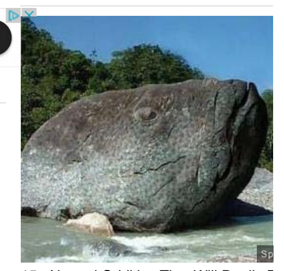
15+ Natural Oddities That Will Really F You Out, Esp. #9