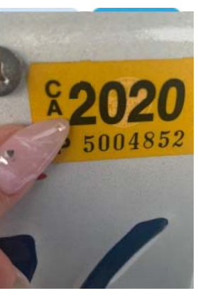
Wisconsin Launches New Policy For Cars Used Less Than 50 Miles/Day