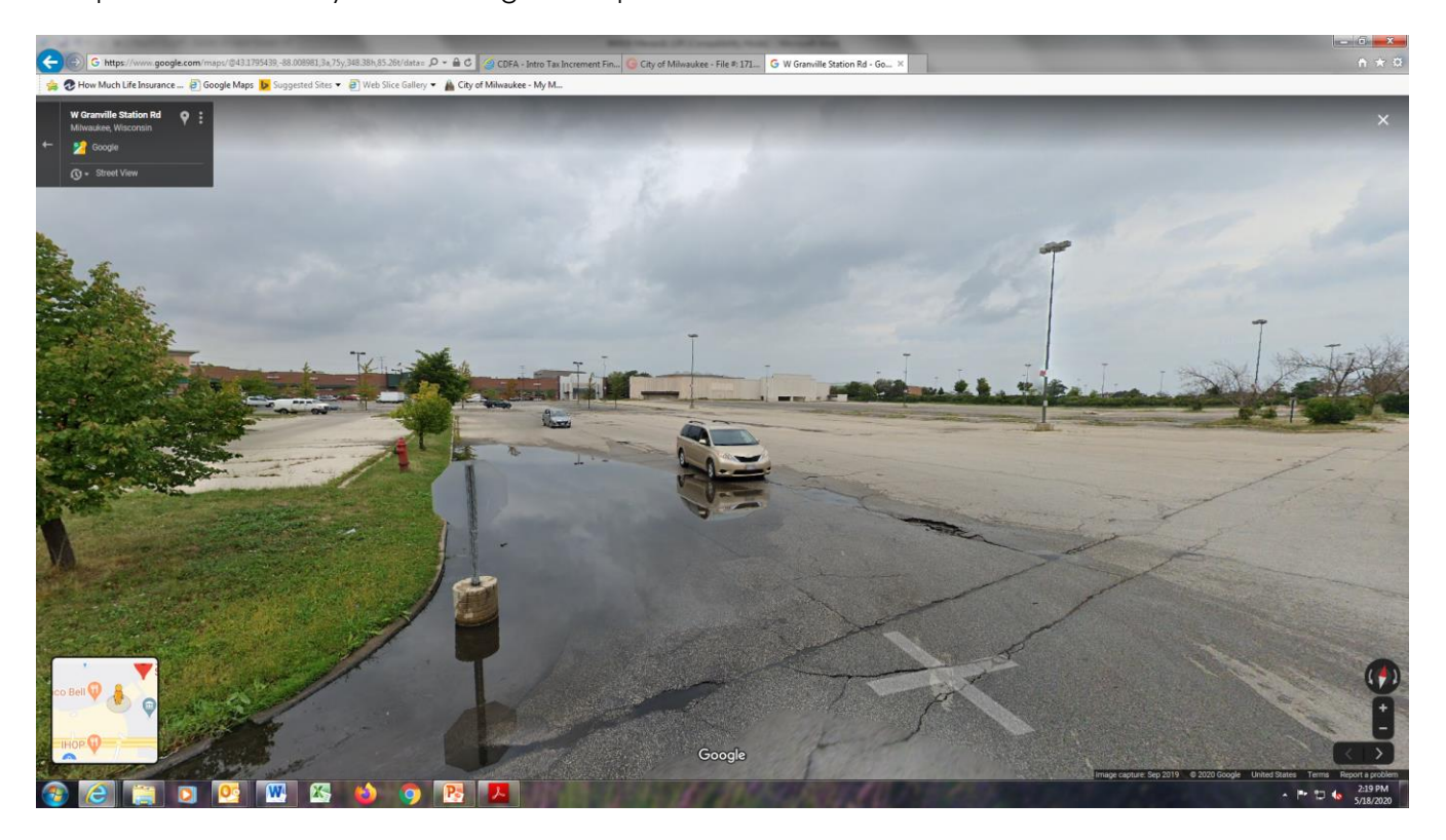
Google Street View Photo (2020)

The proposed acquisition is for approximately 25,000 square feet of vacant land located on North Granville Station Road to be developed as an additional ingress/egress for their customers. Menard's, the company, has been in operation for over 60 years and is currently located adjacent to the subject parcel in Milwaukee, WI. They currently operate a 161,000 square foot store and have a need to improve access for its customers travelling on West Brown Deer Road. Redeveloper plans to begin grading and making improvements in the fall of 2020 and be completed within one year of closing on the parcel.