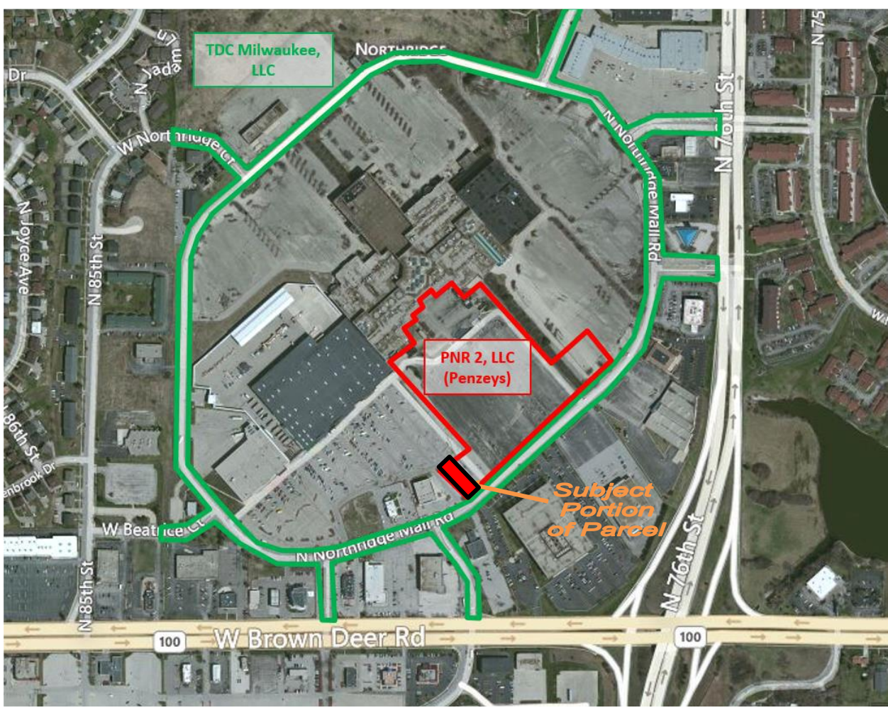
Acquisition of Former Boston Store and Ring Roads (2017)

Granville Station TID No. 51: In 2017, the City of Milwaukee ("City") acquired the 13.1 acre Former Boston Store and associated parking lots from PNR 2 LLC for no cost. At that time, the City also acquired the ring roads from TDC Milwaukee, LLC that surround the Former Northridge Mall.