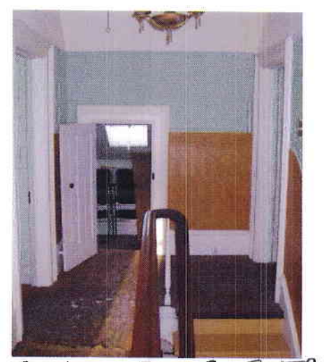
SMALL DOOR ENTRY