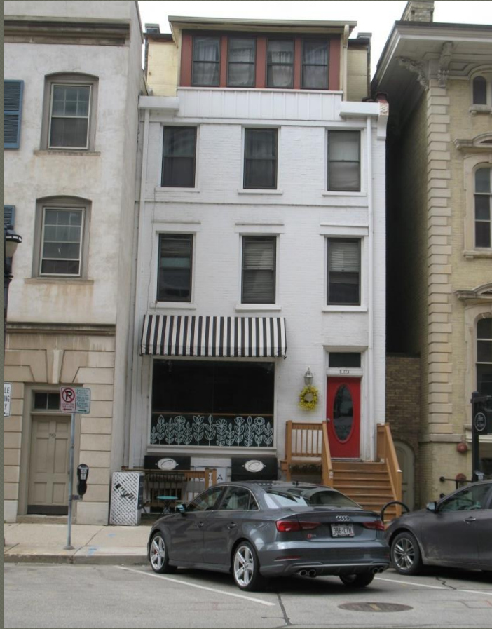
George Augustus Tiffany Rowhouse 771-773 North Jefferson Street (1852) Architect unknown