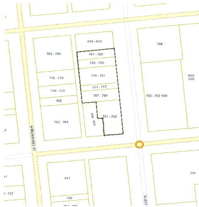
Jefferson Street Historic District