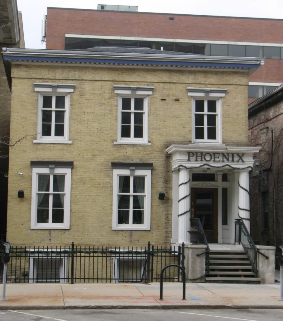
William A. Webber House 783-785 North Jefferson Street (1858) Architect Unknown