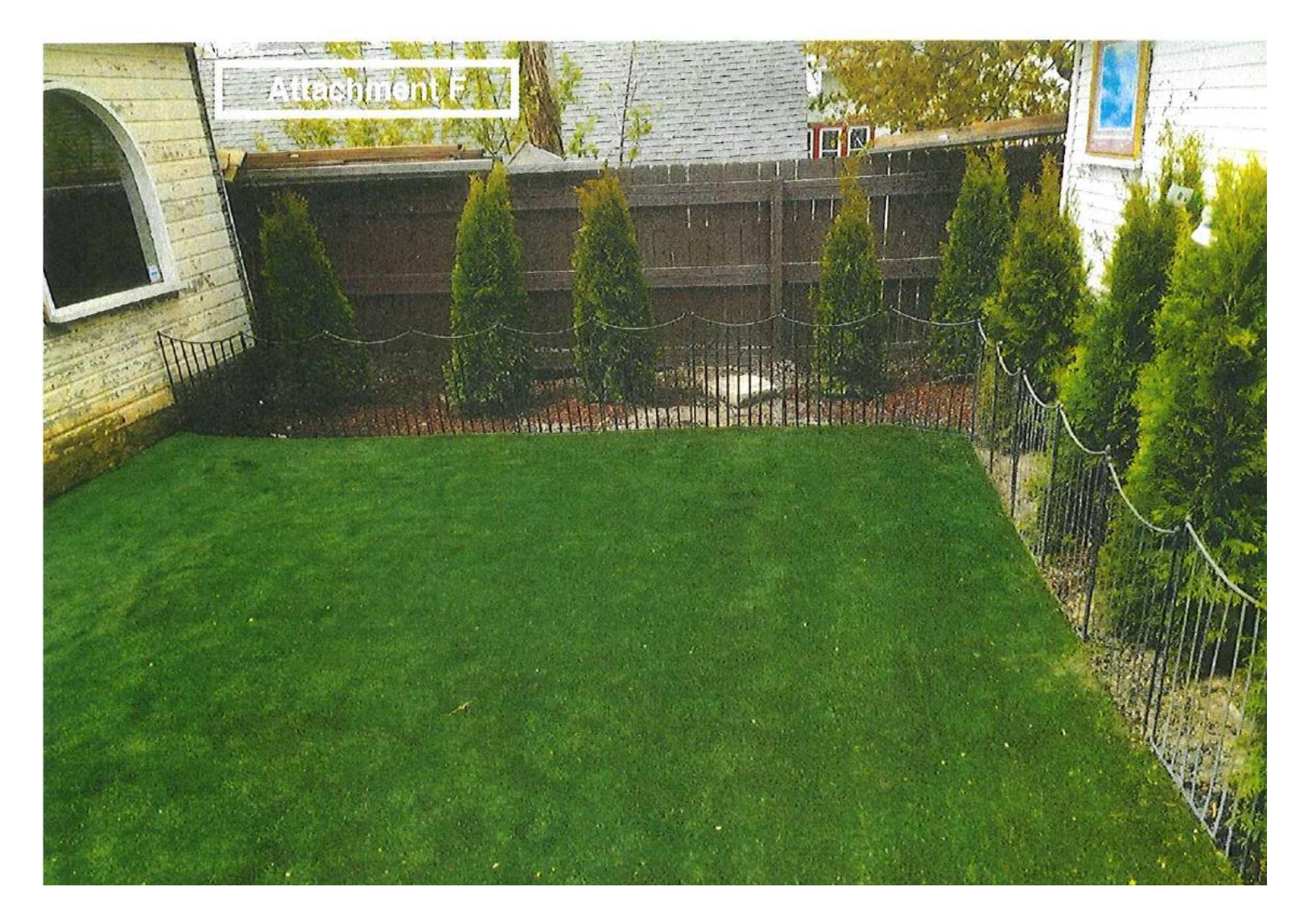
Sample installation from another property.