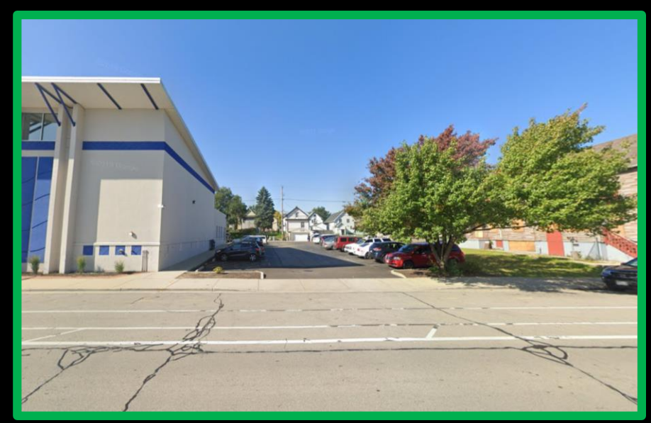
View from South 2<sup>nd</sup> Street looking west