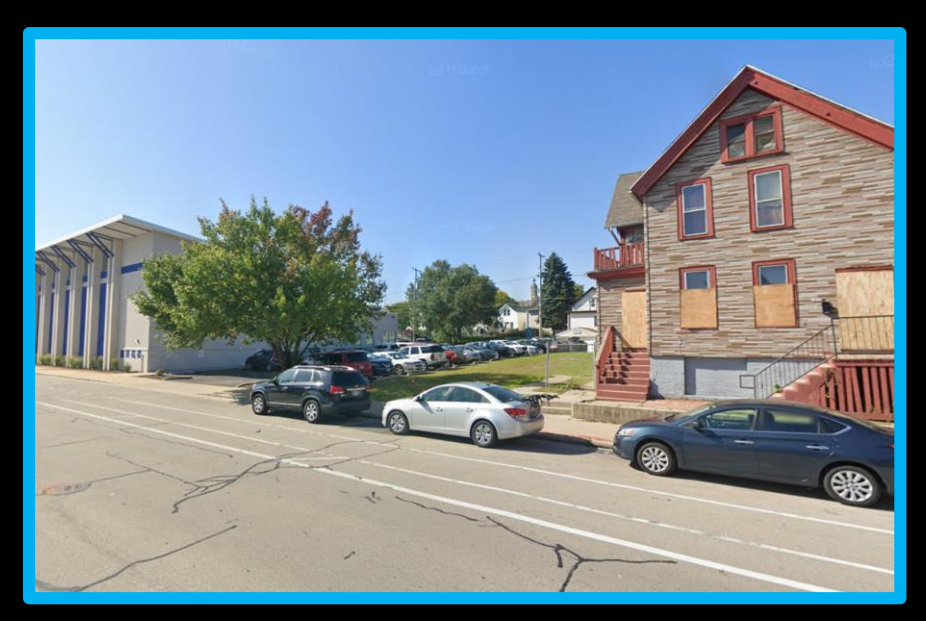
View from South 2<sup>nd</sup> Street looking south-west