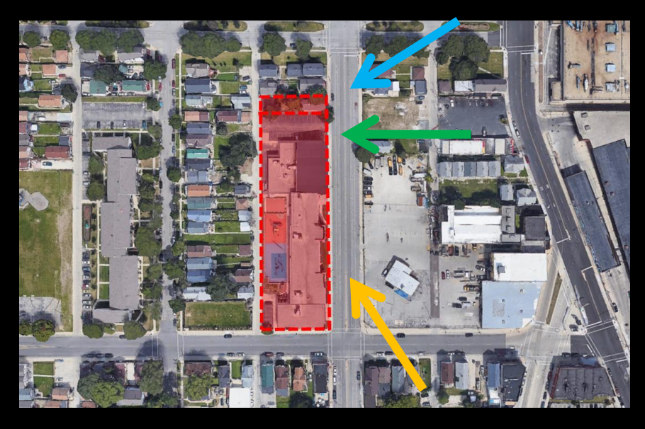
View from South 2<sup>nd</sup> Street looking north-west