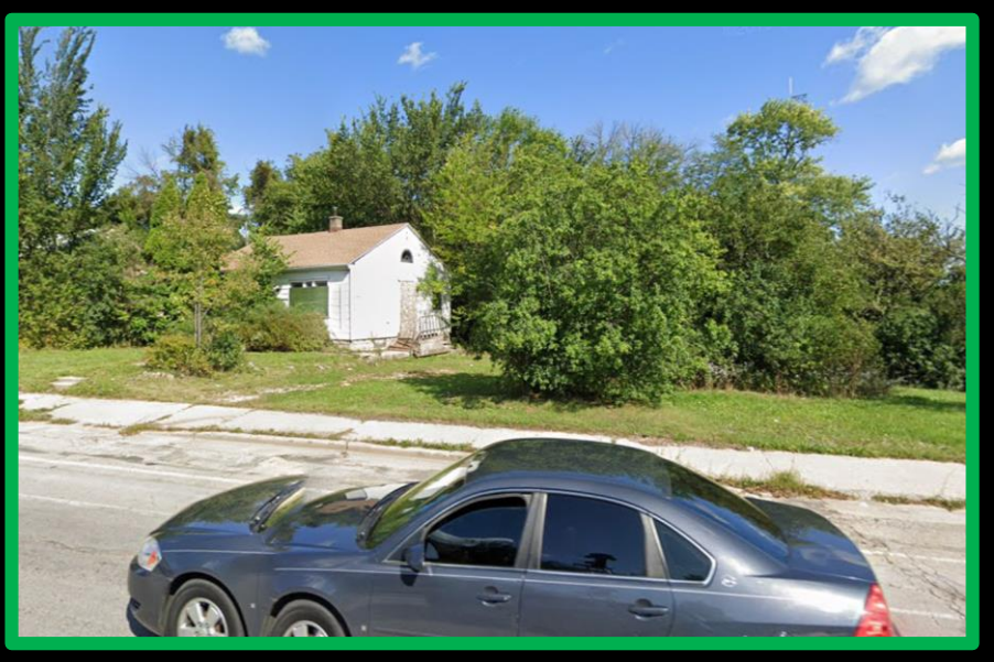
View from North Hopkins Street looking north-east