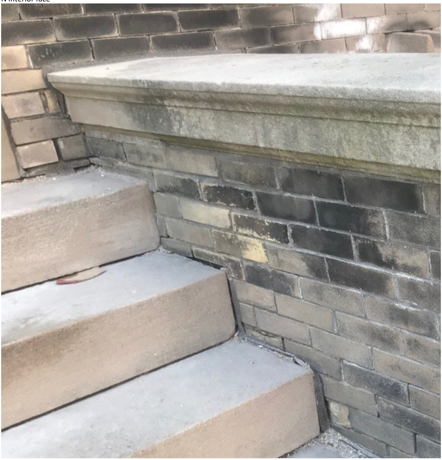
S interior face