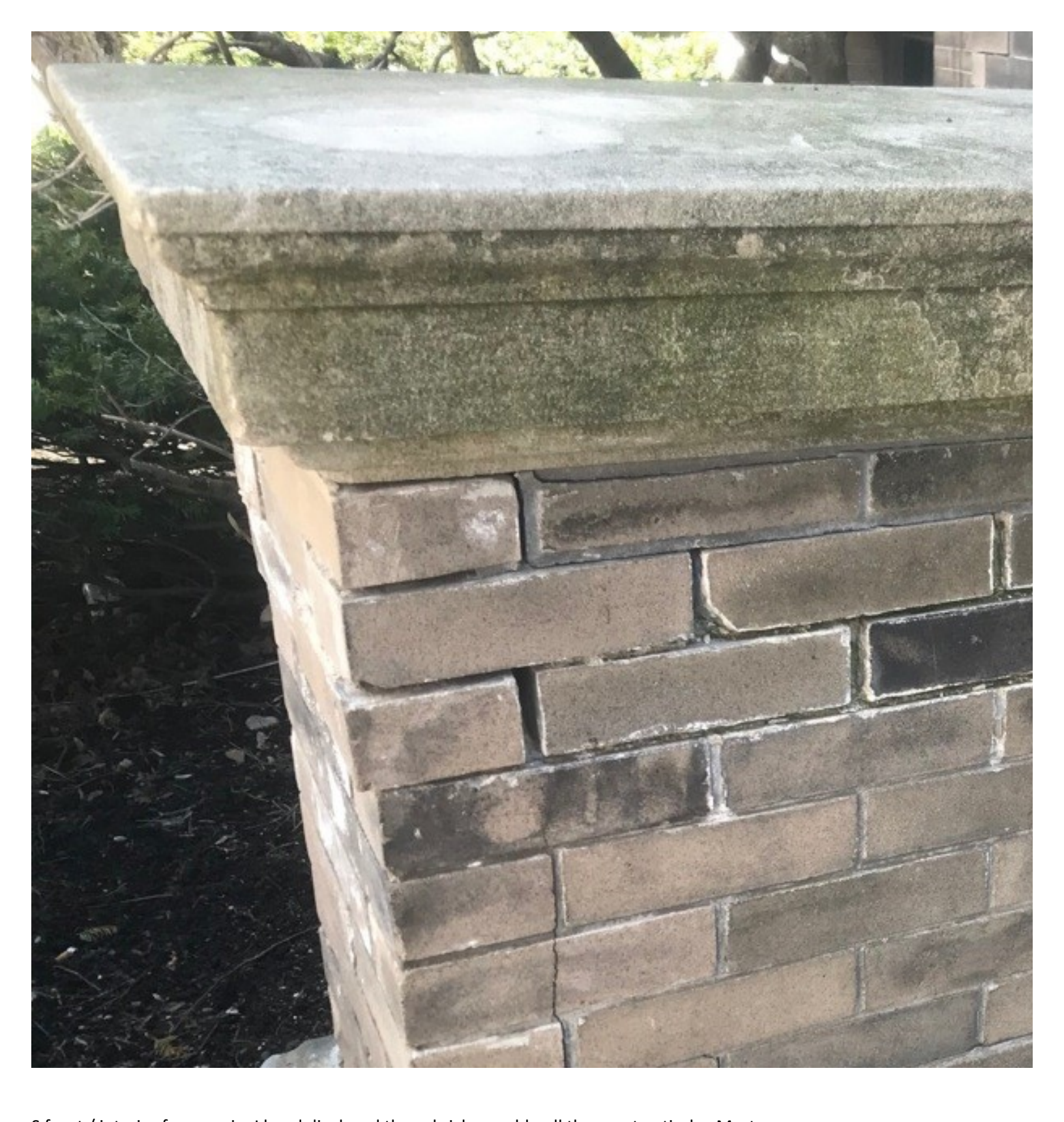
S front / interior face, again, I hand displaced those bricks, could pull them out entirely. Mortar gone.