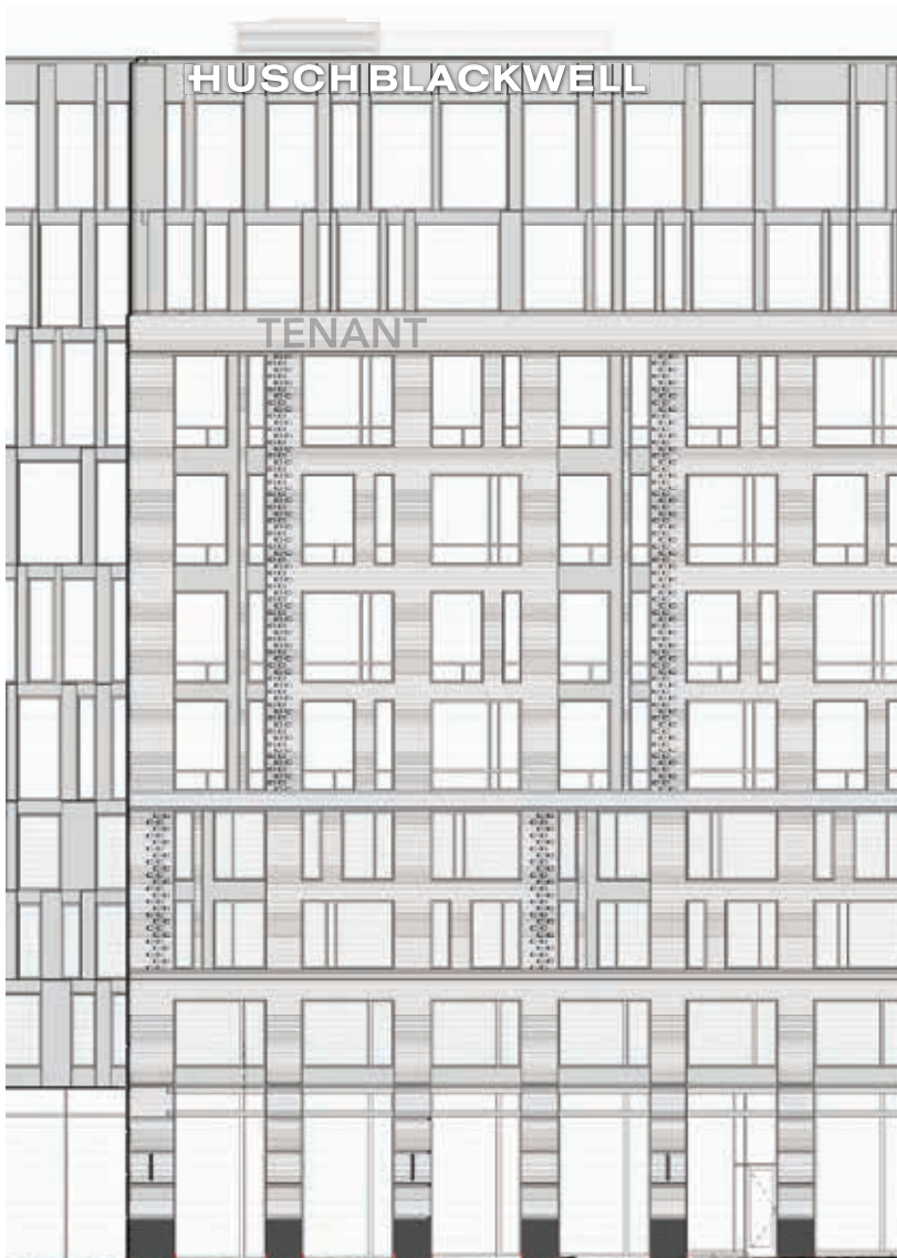
[EAST ELEVATION] proposed layout - day view [NTS]

Lighting: LED Voltage: [TBD] Description: Face-Lit [Acrylic] Face Color: White Return Color: White Trimcap Color: Black Installation: Flush to wall