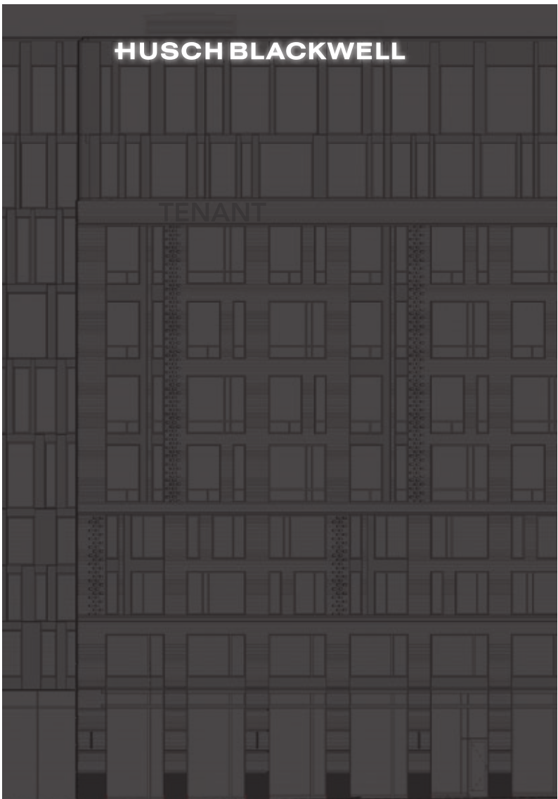
[EAST ELEVATION] proposed layout - night view [NTS]