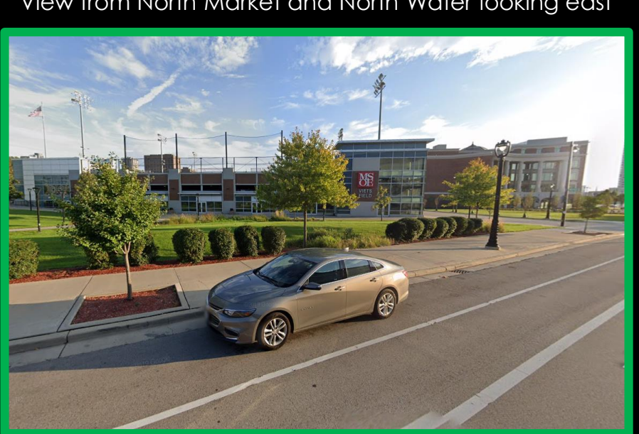
View from North Water Street looking south