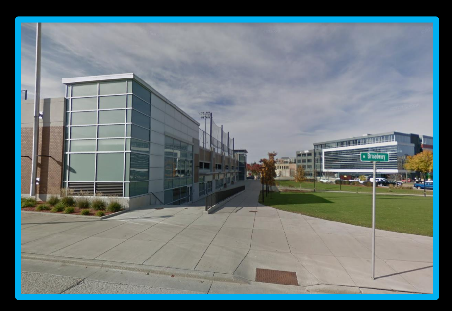
View from North Broadway and East Ogden looking west