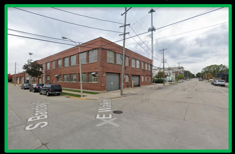
View from East Walker & South Barclay looking south-west