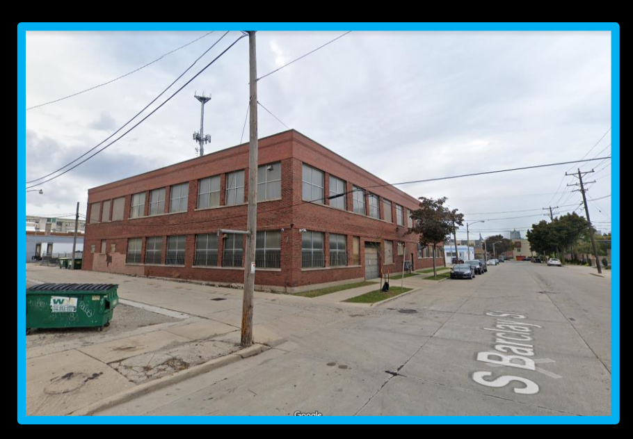
View from South Barclay Street looking north-west