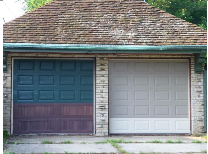
Current garage doors

Email: IdealDoor@clopay.com Phone: 800-621-3667