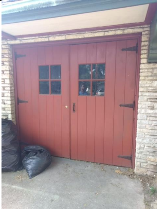
Original garage doors