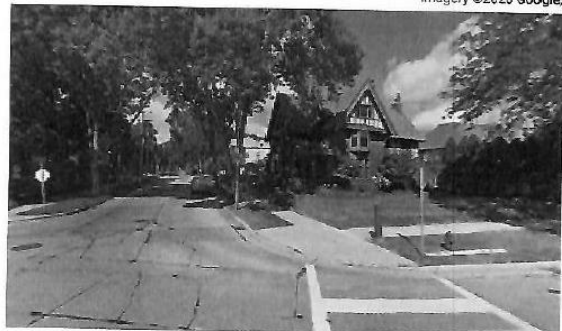
2701 N Lake Dr Milwaukee, WI 53211