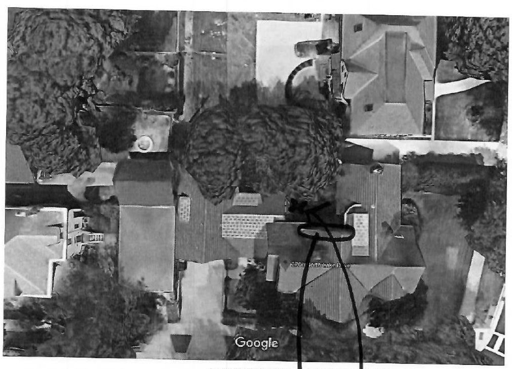
Imagery ©2020 Google, Mag ata @2020 , Map data @2020 20 ft L