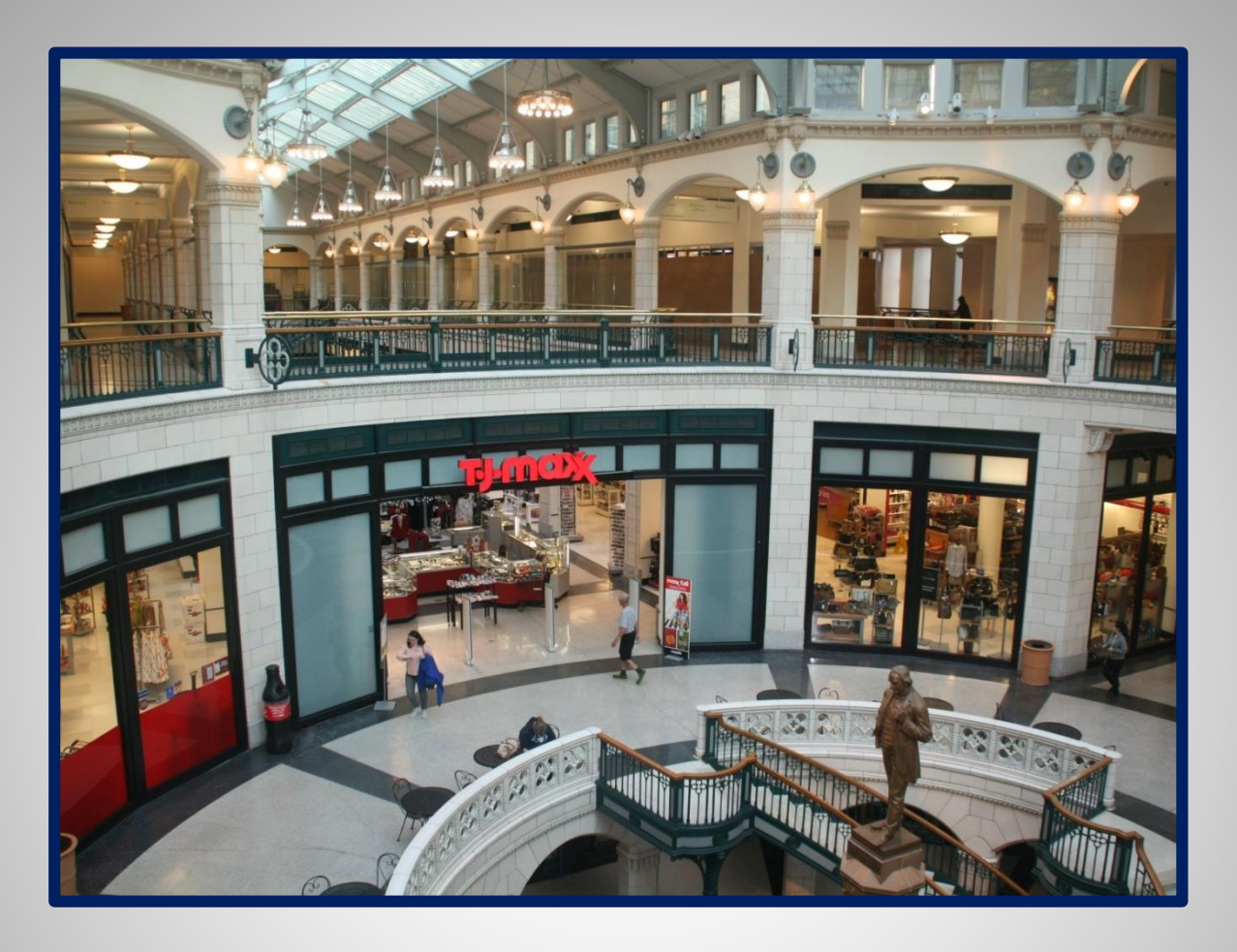
TID #46 – NEW ARCADE-AMENDMENT 1