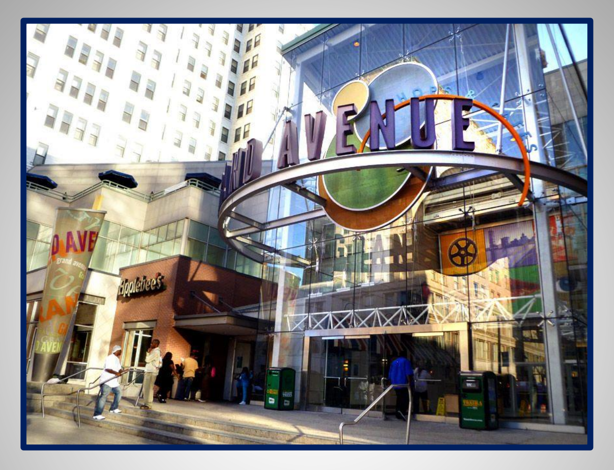
TID #46 - NEW ARCADE