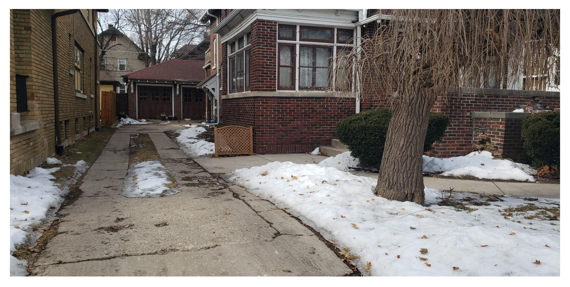
Ramp will follow north/right side of driveway and turn up onto the porch.