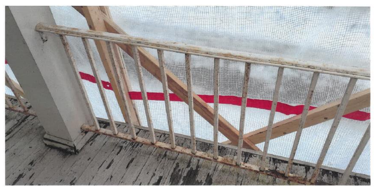
New deck boards and existing railings.