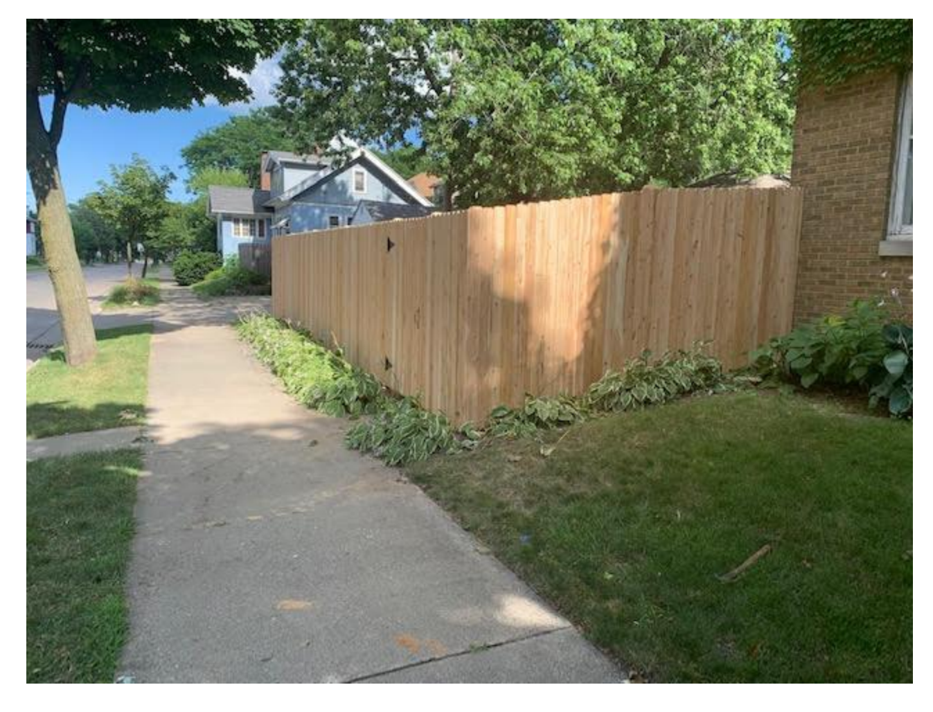
Fence along Locust Street. Fence will have to be moved farther in from the sidewalk.