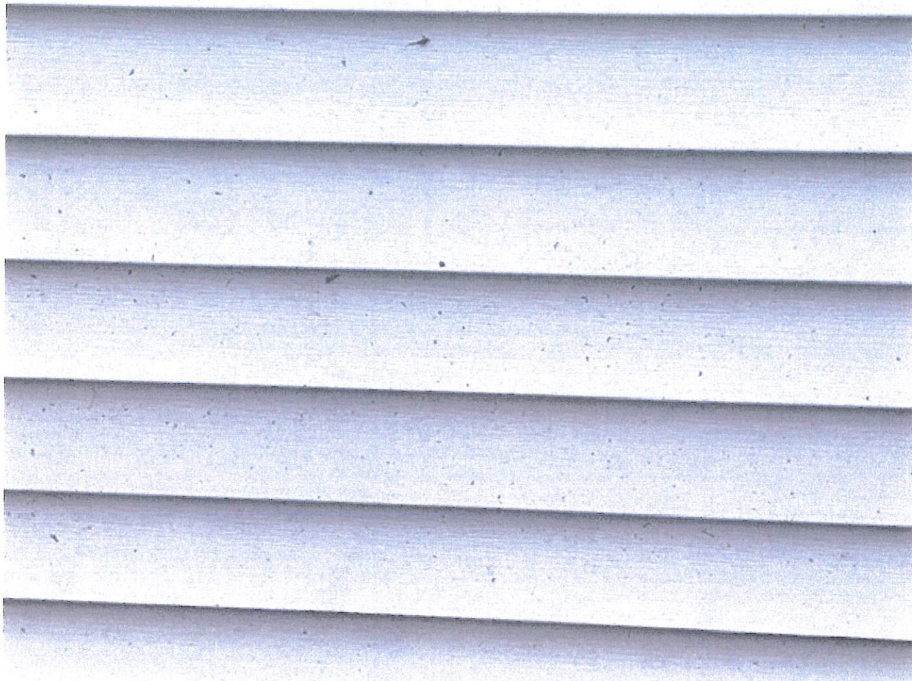
NEIGHBOR'S GARAGE - SOUTH