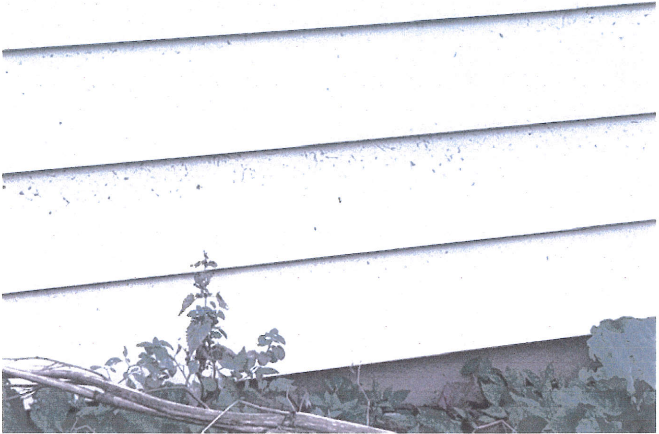
NEIGHBOR'S GARAGE - NORTH