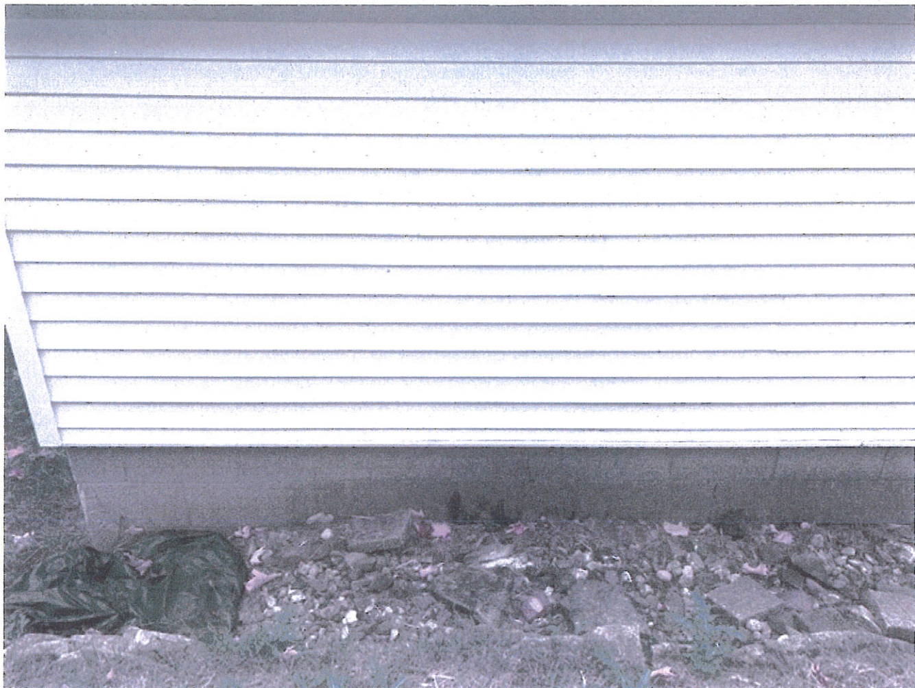
NEIGHBOR'S GARAGE - SOUTH