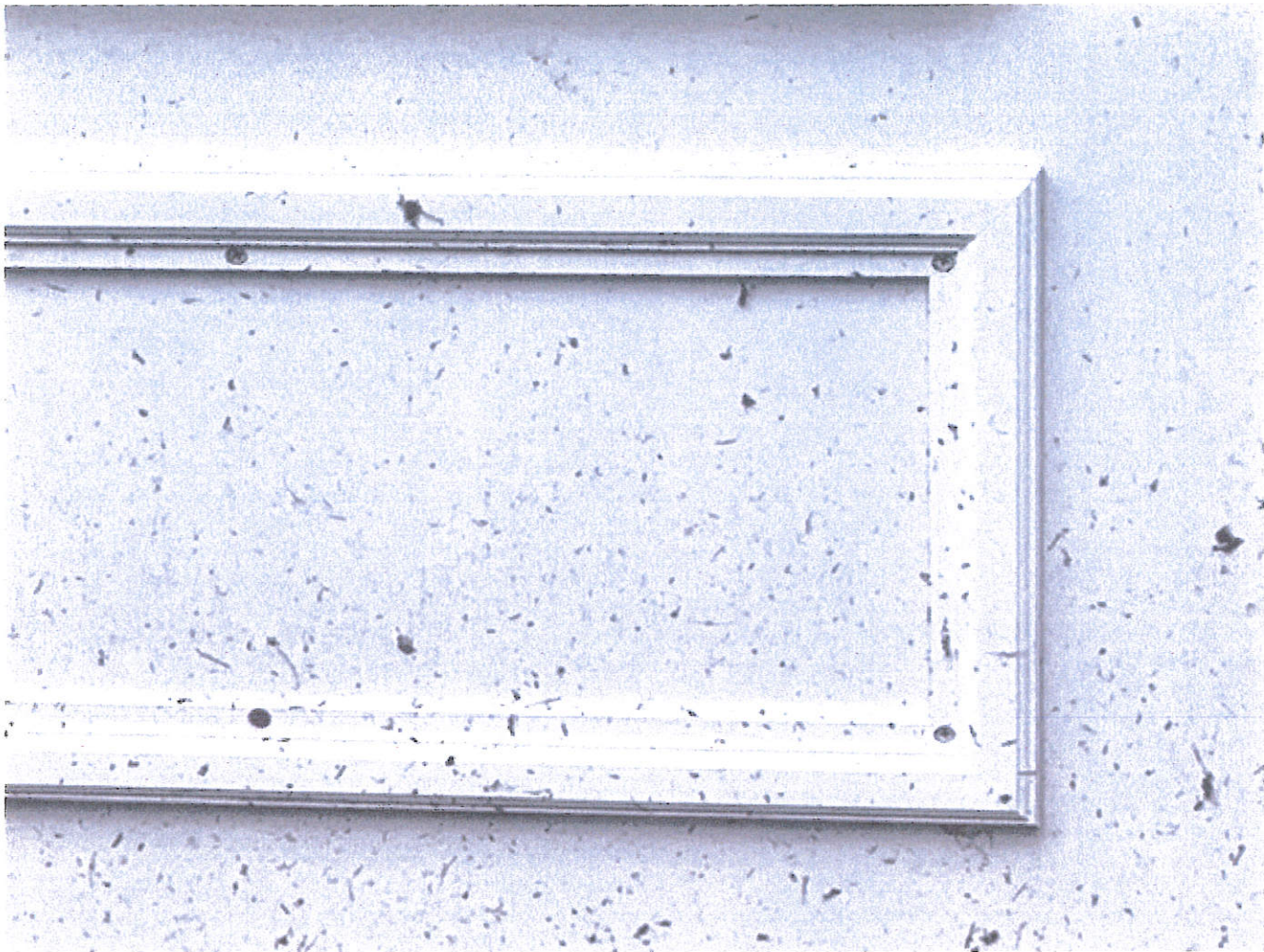
MY BACK DOOR