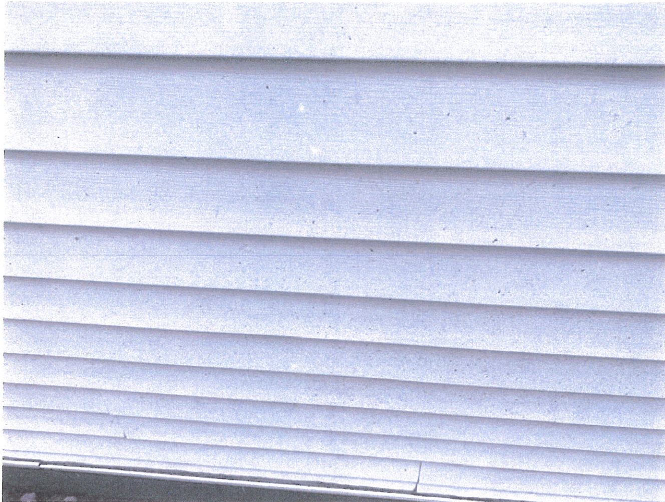
NEIGHBOR'S GARAGE - SOUTH

To: dan_kroening@hotmail.com <dan_kroening@hotmail.com>