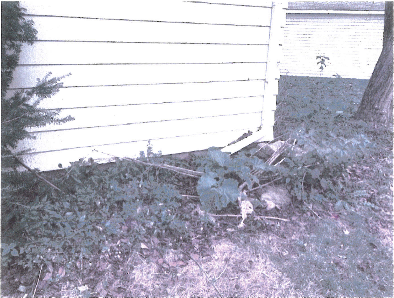
NEIGHBOR'S GARAGE - NORTH