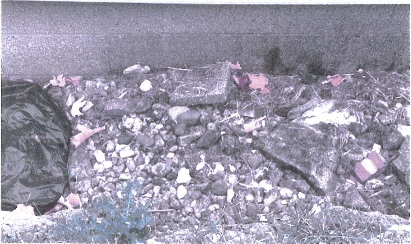
NEIGHBOR'S GARAGE - SOUTH