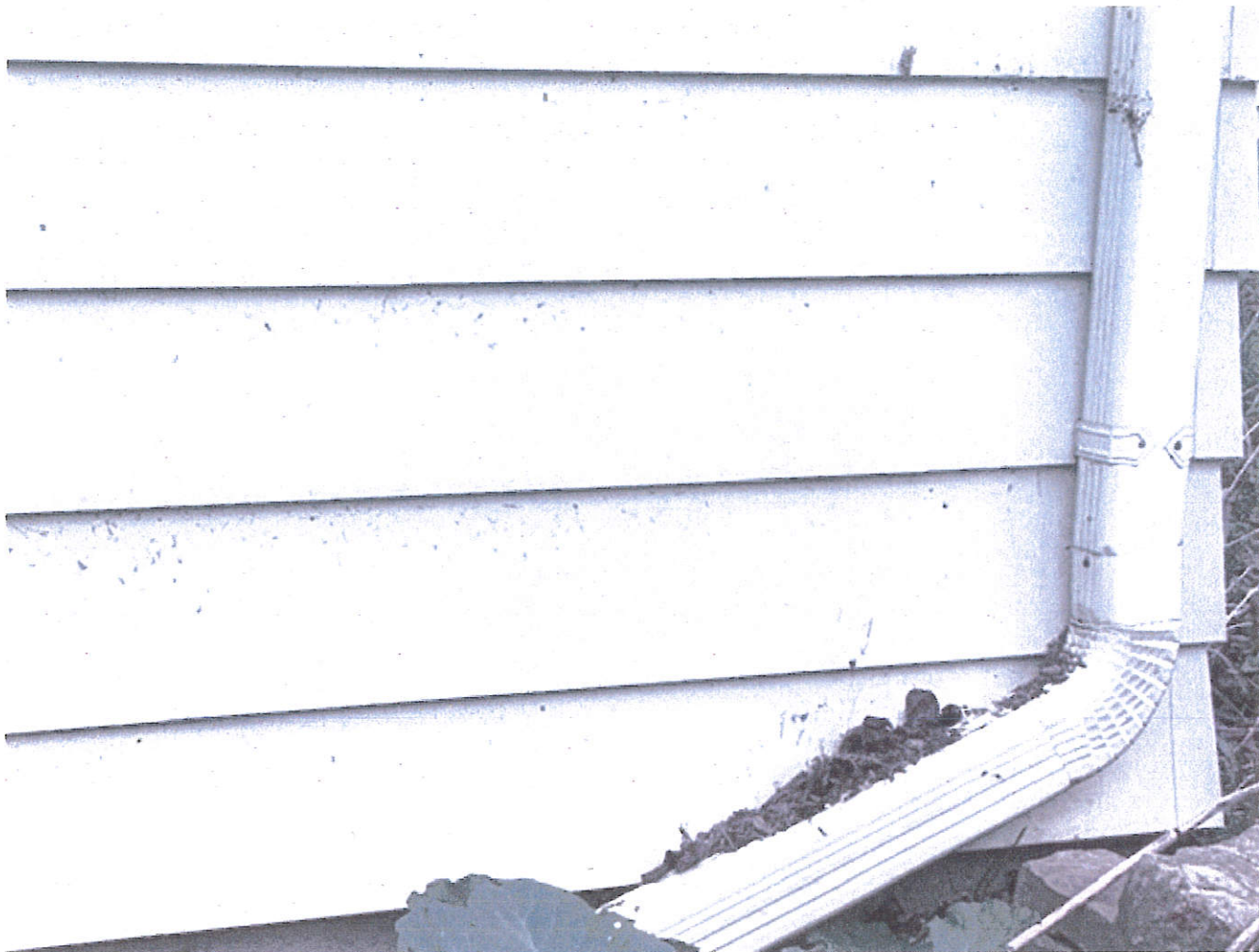
NEIGHBOR'S GARAGE - NORTH