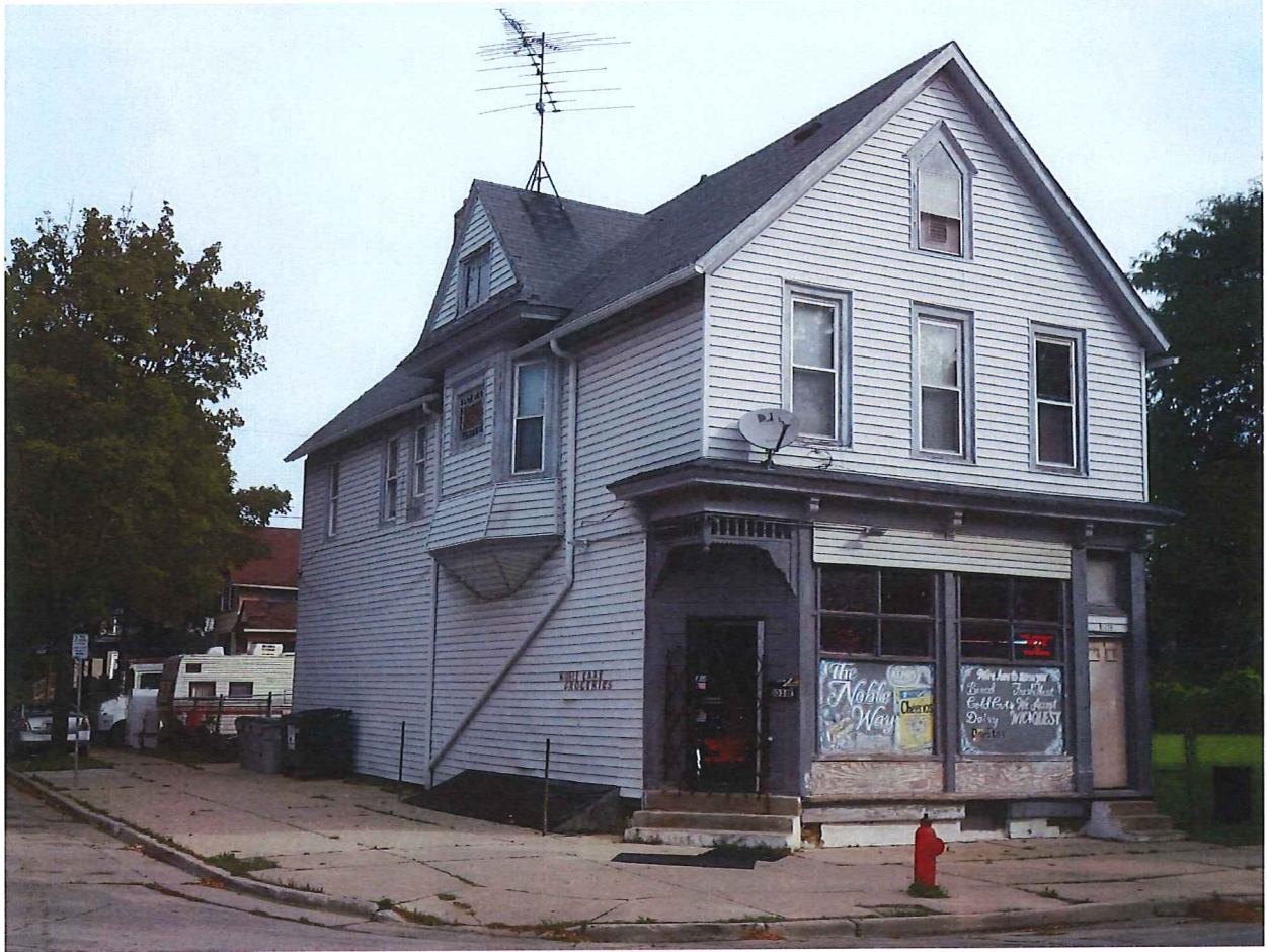
1036-38 W Wright Street